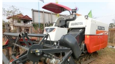
Provision of agricultural equipment (rice harvester machine)