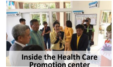
Inside the Health Care Promotion center