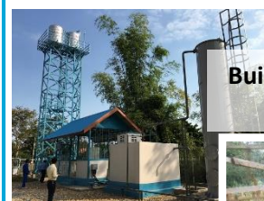
Building water purification plants and wells