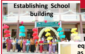
Establishing School building