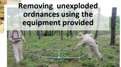
Removing unexploded ordnances using the equipment provided