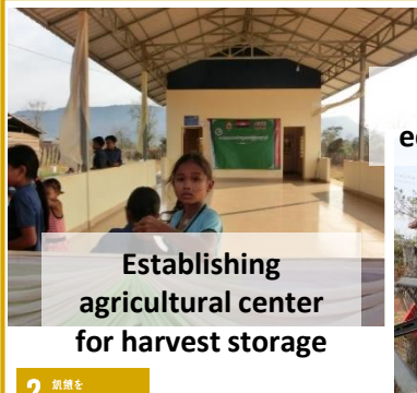
Establishing agricultural center for harvest storage