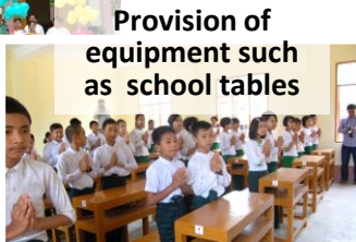
Provision of equipment such as school tables