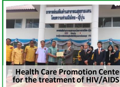
Health Care Promotion Center for the treatment of HIV/AIDS