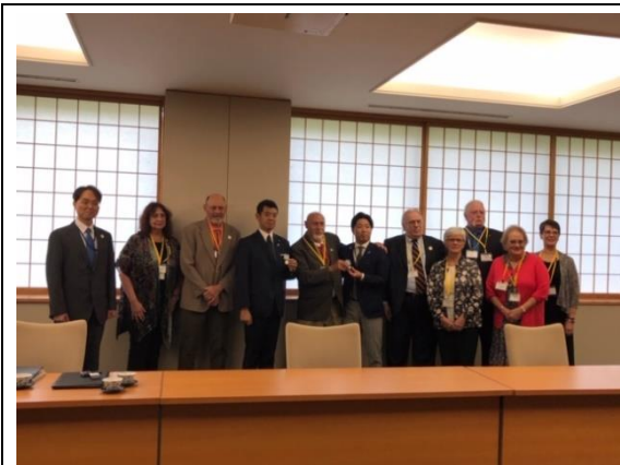
9/2 【 Courtesy Call 】 Mr. Tsuji Kiyoto, Parliamentary Vice-Minister for Foreign Affairs