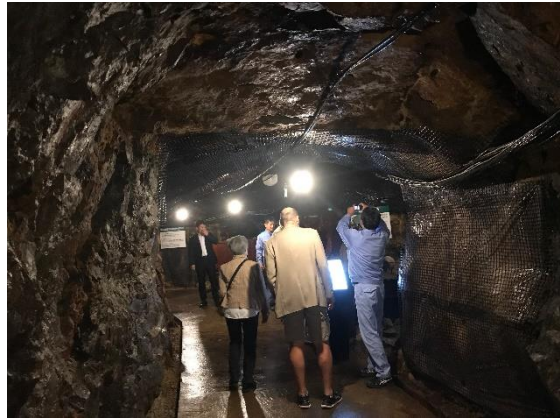
9/4 【Observation】 Hosokura Metal Mining Company and Mine Park