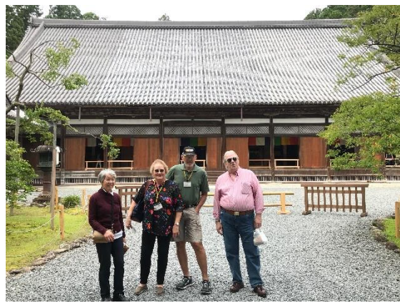
9/5 【Observation】 Zuiganji Temple