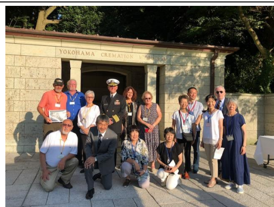
9/2 【Observation】 Common Wealth War Cemetery