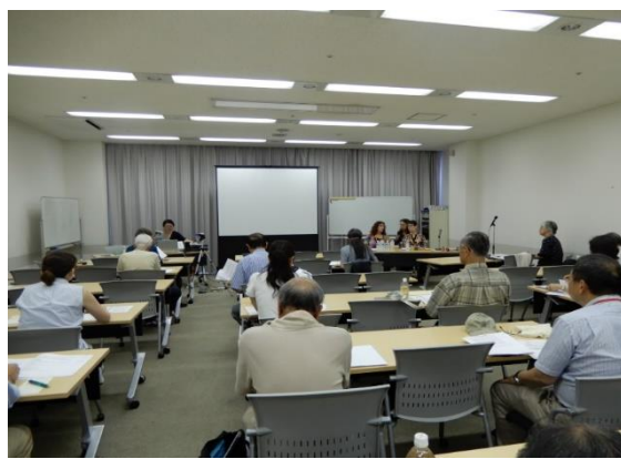
9/4 【 Observation & Exchange 】 Kyoto Museum for World Peace, Ritsumeikan University