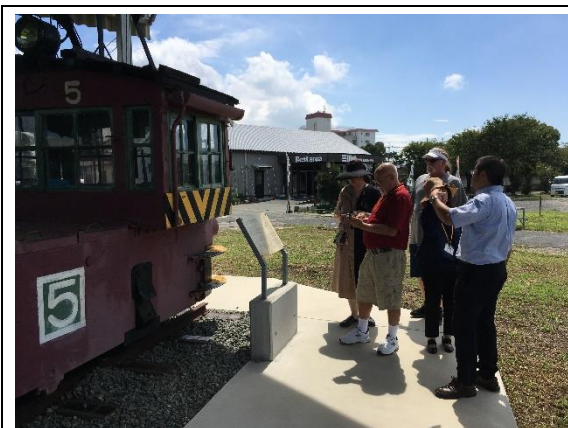
9/5 【Observation】 Former Coal Mine Site