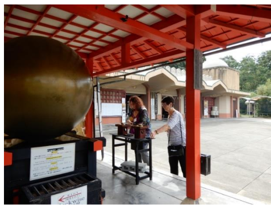
9/5 【Observation】 Ryozen-Kannon Temple