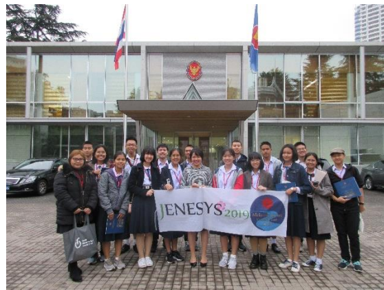
November 27th 【Courtesy Call】 Royal Thai Embassy in Japan