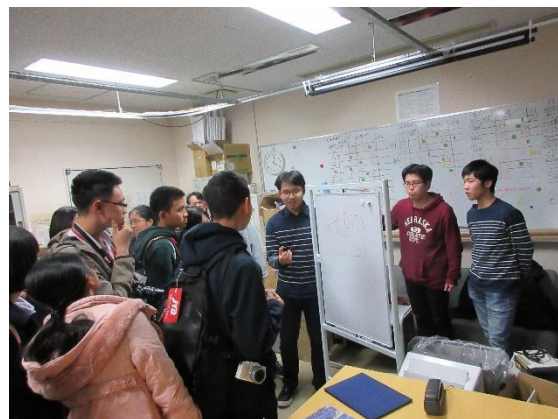
November 30th 【Observation】 TSUBAME Industrial Materials Museum,