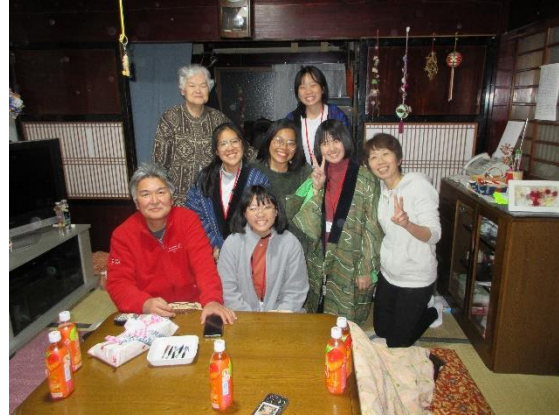
November 30th 【Homestay】 Ojiya City