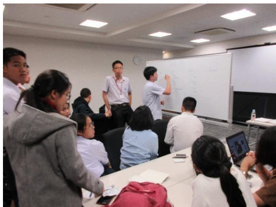
December 2nd 【Workshop】