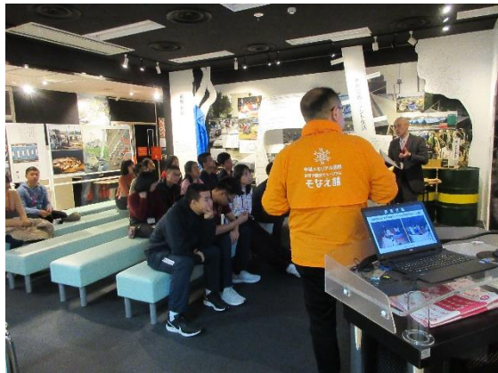
December 1st 【Observation】 Chūetsu Organization for Safe and Secure Society