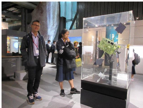
November 27th 【Theme-related Observation】 MIRAikan (Advanced Technology)