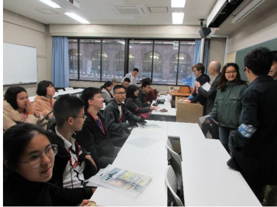
November 26th 【School Exchange】 Tokyo University of Institute