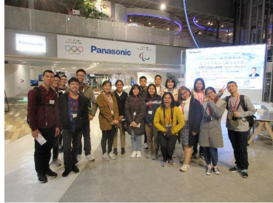
November 26th 【Theme-related Observation】 Panasonic Center Tokyo