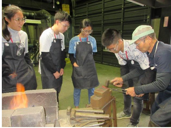
November 30th 【Observation】 SANJŌ Kaji-Dojō