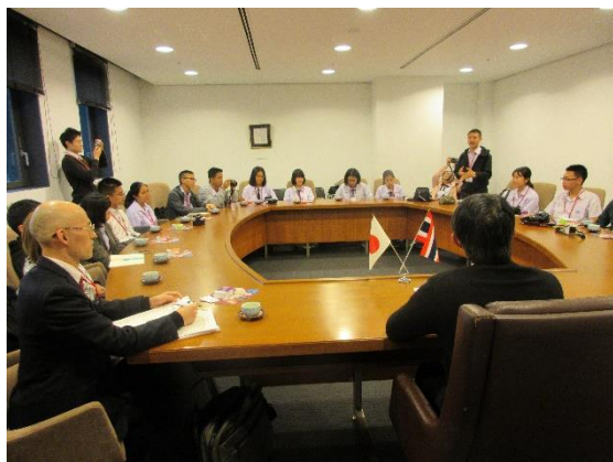
November 29th 【Courtesy Call/Discussion】 Nagaoka City