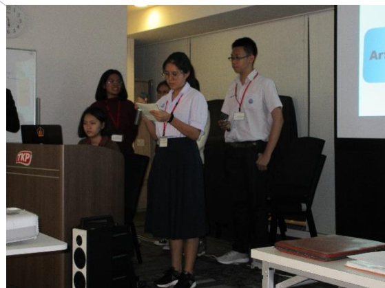
December 2nd 【Reporting Session】