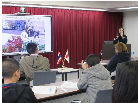
December 1st 【School Exchange】 Nagaoka University of Technology