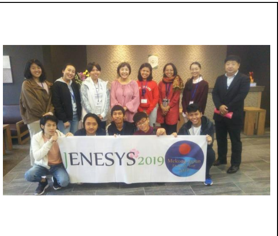
October 11th to 13th 【Theme-related Observation】 Yamagata International Documentary Film Festival