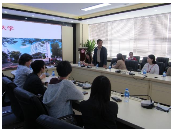
November 15th 【School Exchange】 Hanoi Foreign Trade University