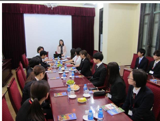
November 13th 【Courtesy Call】 Youth International Cooperation Development Center (CYDECO)