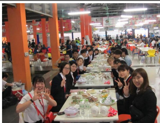
November 14th 【Dinner Exchange】 FPT University