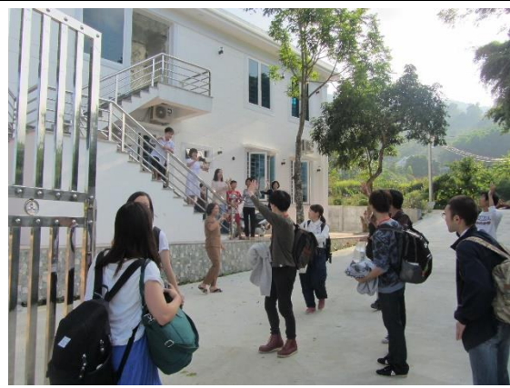
November 16th 【Homestay】