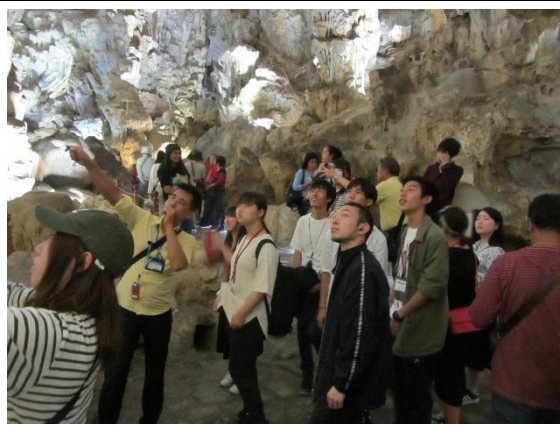
November 17th 【Cultural Observation】 Halong Bay