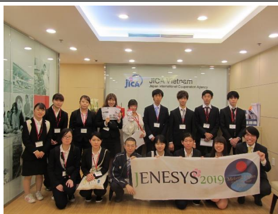
November 14th 【Lecture】 JICA