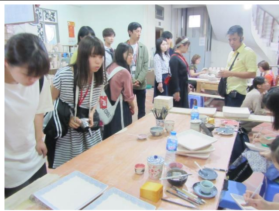
November 17th 【Cultural Observation】 Bachchan Village