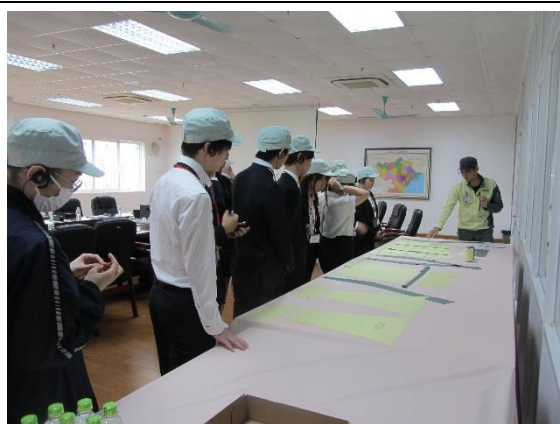
November 14th 【Japanese Company Visit】 MIDORI APPAREL VIETNAM