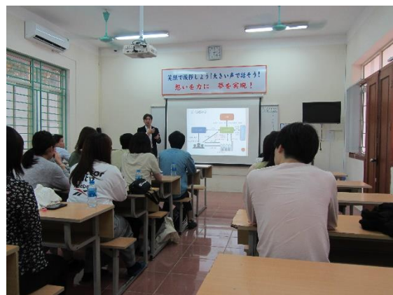
November 18th 【Japanese Learning Center Visit】 JVNET