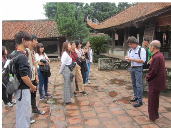
November 18th 【Cultural Observation】 Duonglam Village