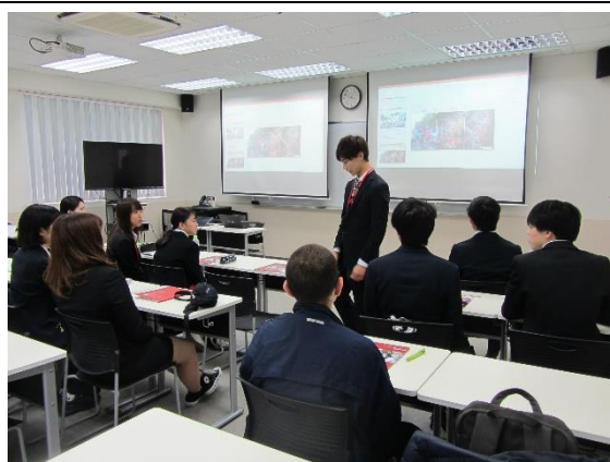
November 14th 【ODA-site Visit】 Project for the Establishment of the Master Programs of Vietnam-Japan University