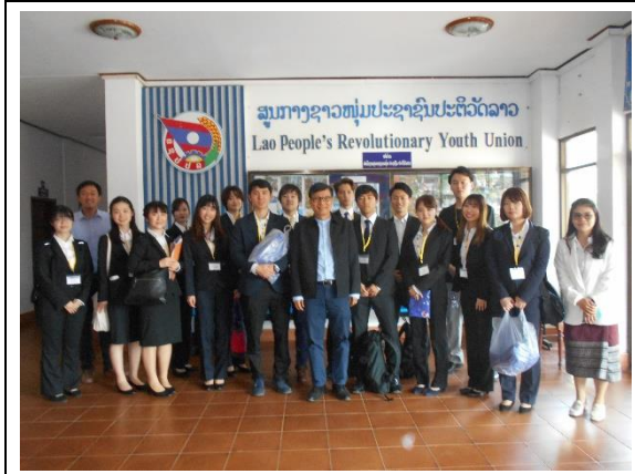
February, 19 【Courtesy Call】 Laos Youth Union