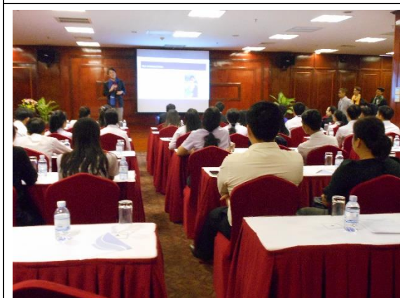
February, 25 【Reporting Session】