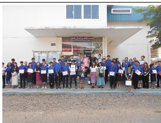
February, 21 【School Exchange】 National University of Laos