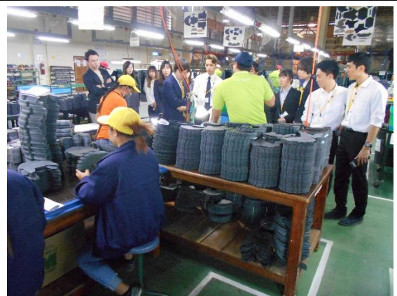
February, 20 【Observation】 Laos Midori Safety Shoes Co.,Ltd