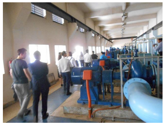
February, 19 【City Observation】 Japan's ODA Sites: Vientiane Capital Water Supply Expansion Project by JICA