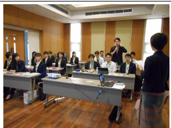
February, 19 【Courtesy Call】 Embassy of Japan in Laos