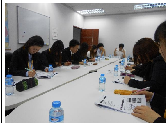
February, 20 【Lecture】 JETRO Vientiane Office