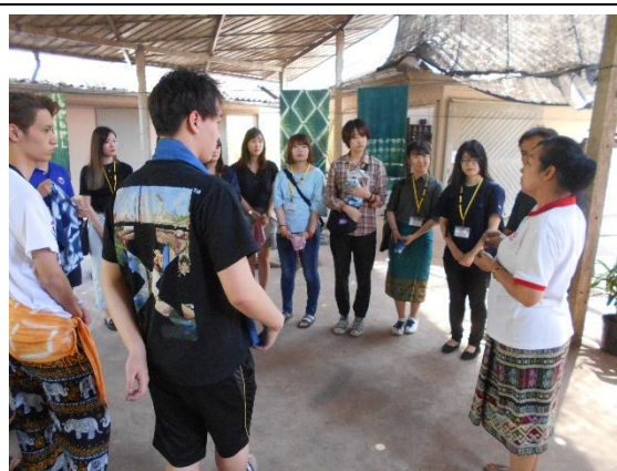
February, 24 【Observation】 Houey Hong Vocational Training Centre