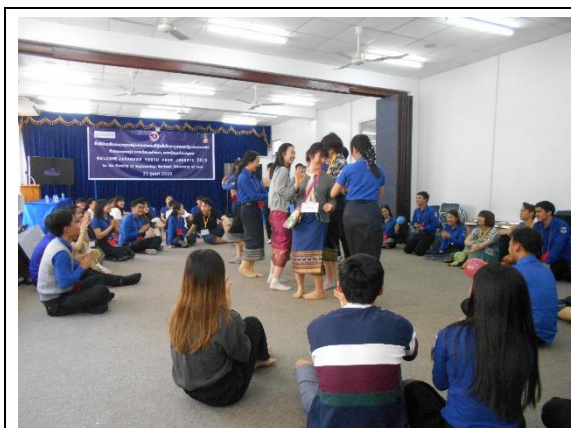
February, 21 【School Exchange】 National University of Laos