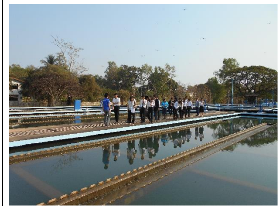
February, 19 【City Observation】 Japan's ODA Sites: Vientiane Capital Water Supply Expansion Project by JICA