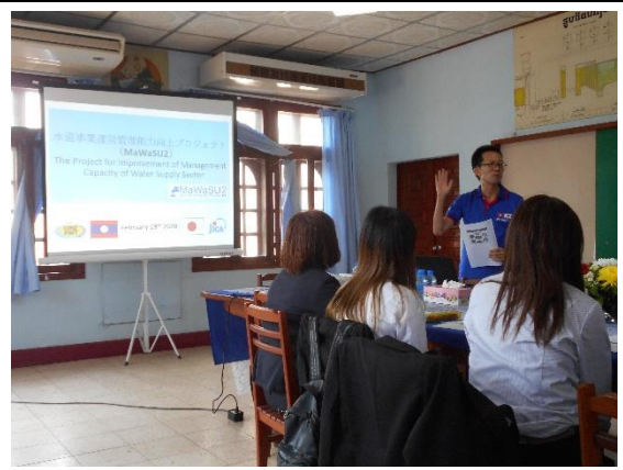
February, 19 【City Observation】 Japan's ODA Sites: Vientiane Capital Water Supply Expansion Project by JICA