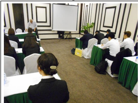
February, 19 【Orientation】