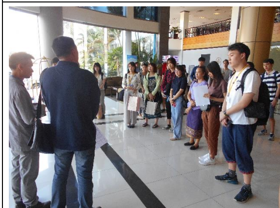
February, 22 【Home-stay】