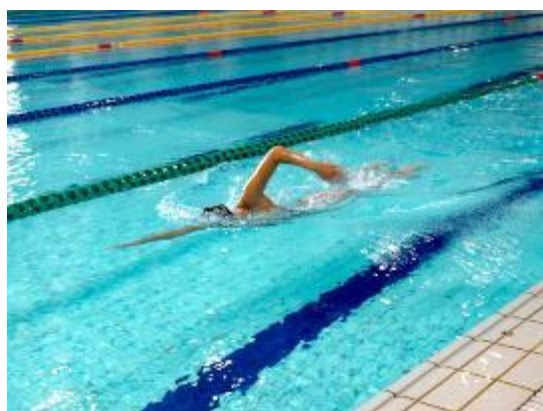
1/17 【Observation / Experience】 Tokyo Tatsumi International Swimming Center