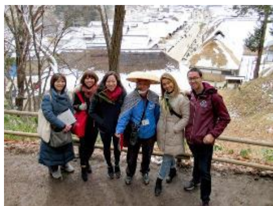
1/18 【Observation】 Ouchi-juku