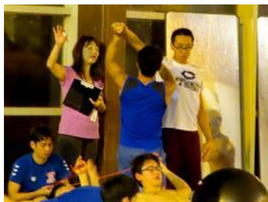
1/16 【Sport Exchange】 Tokai University