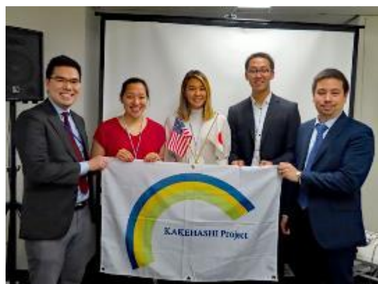
1/21 【Reporting Session】