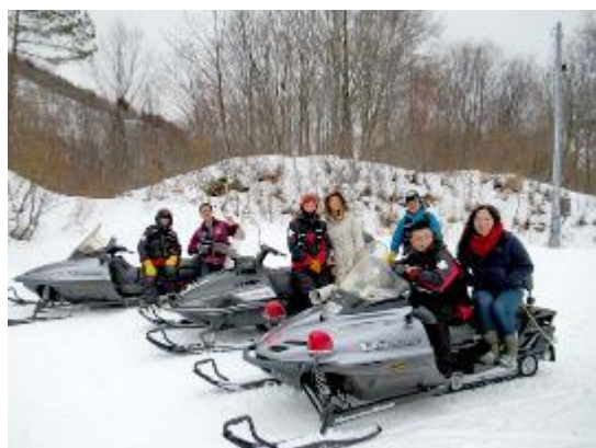
1/18 【Sport Experience】 Snowmobile tours experience