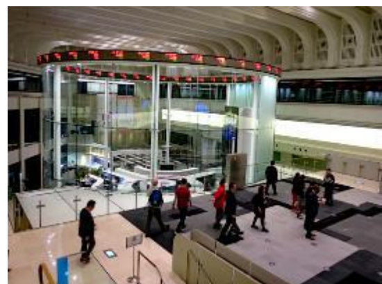
11/14 【Observation】 Tokyo Stock Exchange