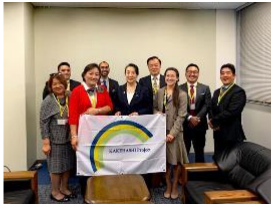
11/12 【Courtesy Call】 Ms. OMI Asako, Parliamentary Vice-Minister for Foreign Affairs