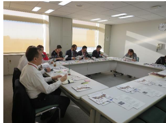
11/12 【Briefing】 Office for Housing Policy, Housing Planning Department, Bureau of Urban Development of Tokyo Metropolitan Government