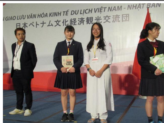
January 12th 【Exchange Program】 Japan-Vietnam Friendship Reception “Yube”