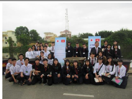
January 11th 【Exchange Program】 Lotus Planting