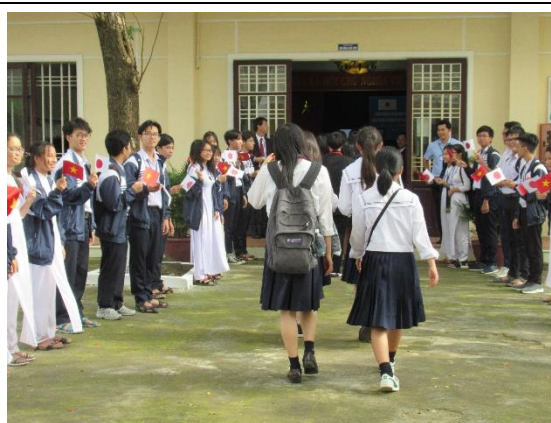
January 11th 【Student Exchange】 Quang Nam Province Le Thanh Tong high school