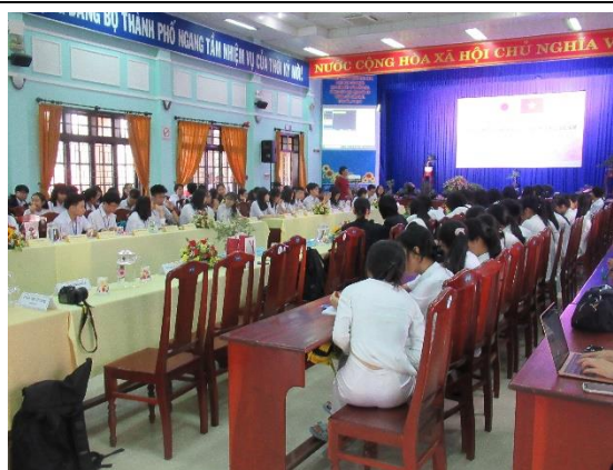
January 13th 【School Exchange】 Exchange with High School Students