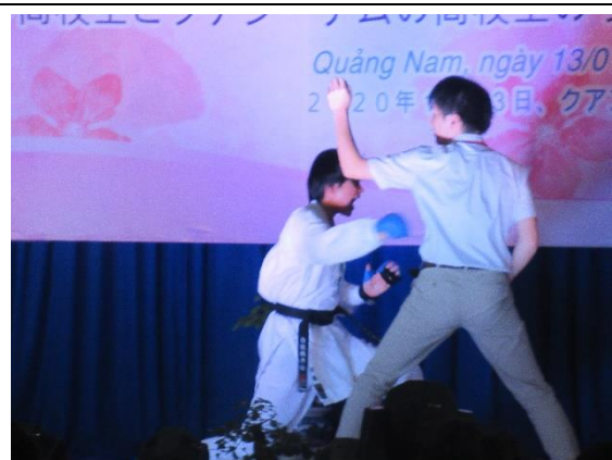
January 13th 【School Exchange】 Exchange with High School Students