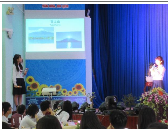
January 13th 【School Exchange】 Exchange with High School Students