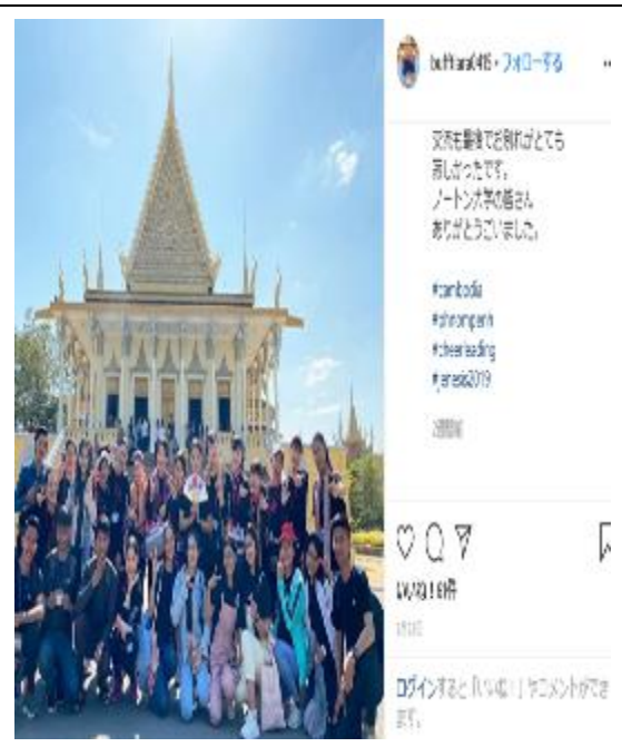
A post about Royal Palace, with students of Norton University (Instagram)