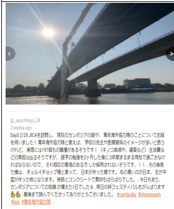
A post about visiting JICA “Japan’s contribution to Cambodia” (Instagram) : Japan assists Cambodia in various ways.