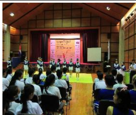
February 21st 【Participation】 KIZUNA Festival (Briefing on Cheerleading, Performance)