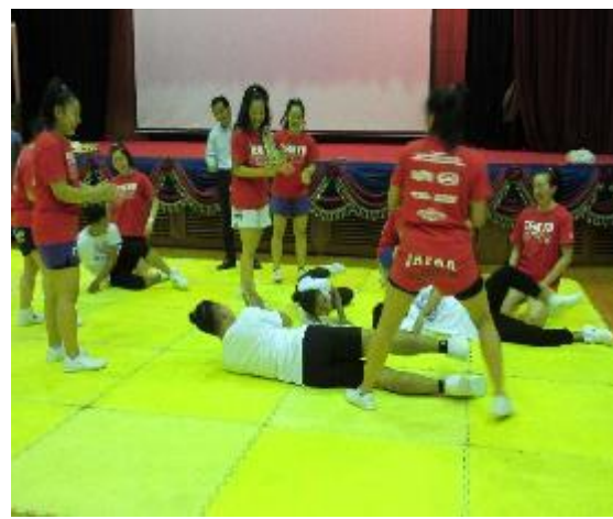
February 19th 【School Exchange】 Joint Training at Norton University