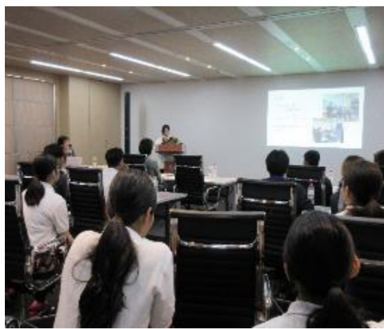
February 25th 【Reporting Session】