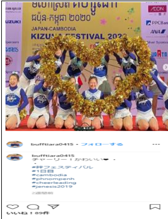
Post about KIZUNA Festival (Briefing on Cheerleading and Performance) : Want to appeal the attraction of Cheerleading (Instagram)