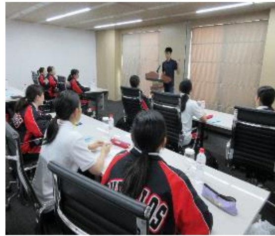
February 19th 【Orientation】