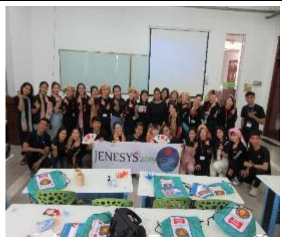
February 22 nd 【School Exchange】 Norton University