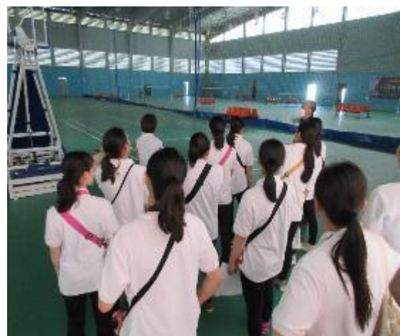
February 24th 【Japanese Company Visit】 Platinum Sports Center