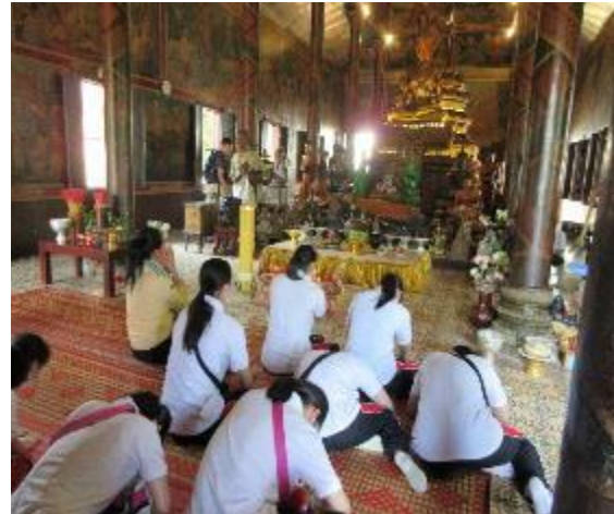
February 20th 【Observation】 National Museum, Wat Phnom