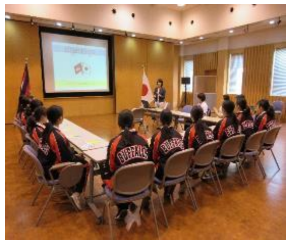
February 19th 【Courtesy Call】 Embassy of Japan in Cambodia