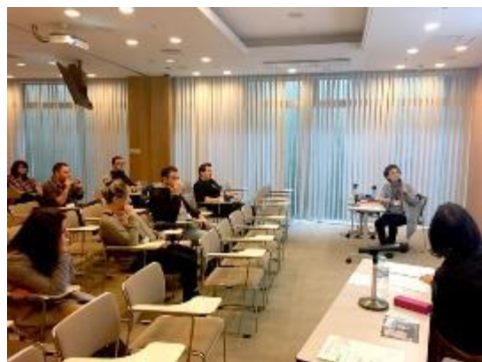
11/23 【Lecture】 Testimony of Atomic Bomb survivor