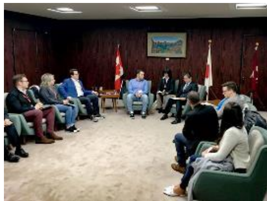
11/21 【Courtesy Call】 Hiroshima Prefecture