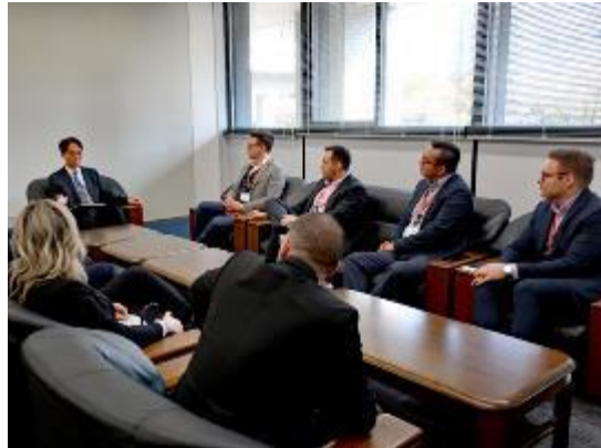
11/18 【Lecture】 The North American Affairs Bureau, Ministry of Foreign Affairs