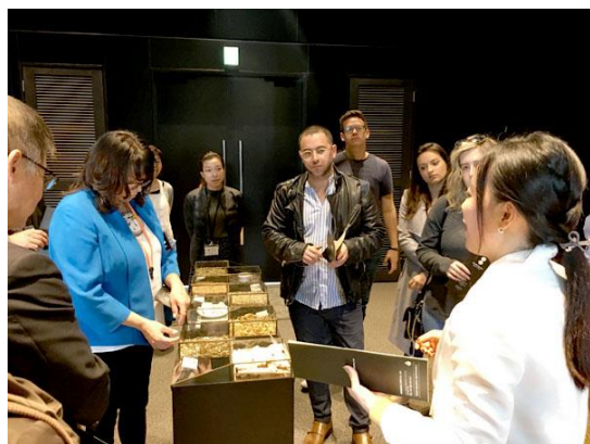
11/21 【Observation】 Chugoku Joze Co., Ltd.