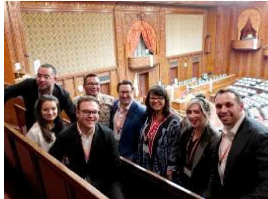
11/19 【Observation】 The National Diet Building