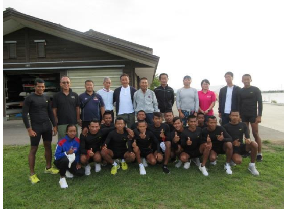
September 19 [Joint practice] Kibagata Canoe Stadium