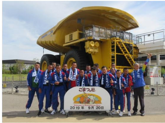
September 20 [Tour] Komatsu Ltd.