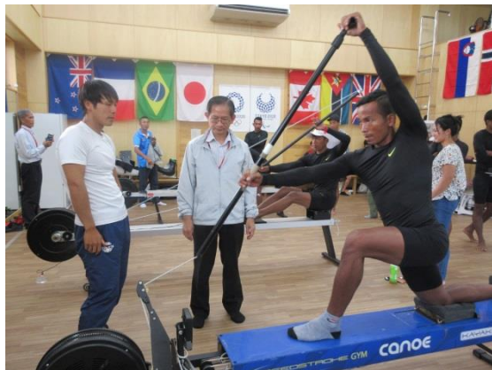
September 20 [Joint practice] Kibagata Canoe Stadium