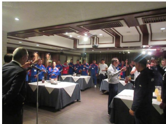
September 20 Social gathering with tournament participants