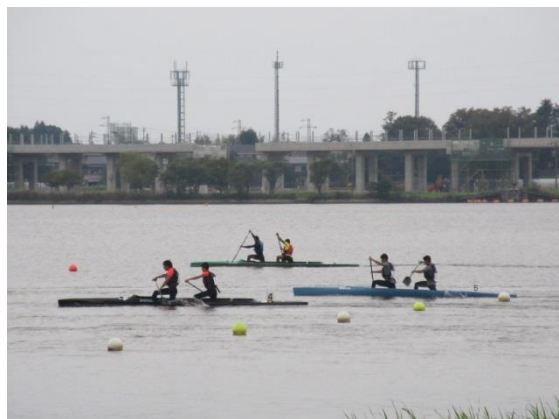
September 22 Tournament participation