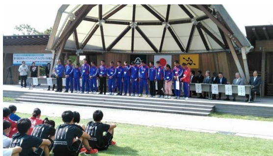
September 21 Tournament participation (opening ceremony)