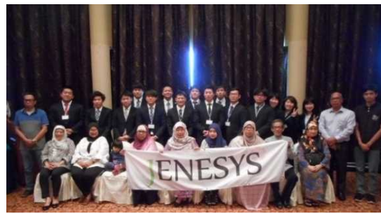
Jan. 29 【Reporting Session】