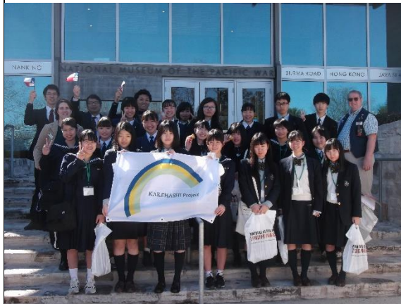
1/27 【Observation】 National Museum of the Pacific War