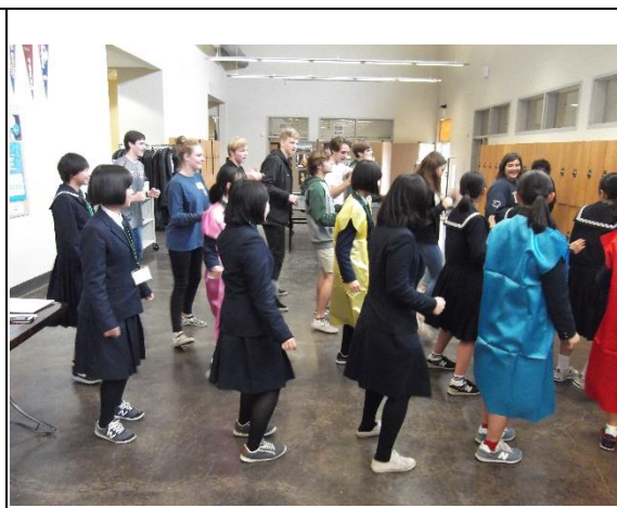
1/25 【School Exchange 1】 Heritage School