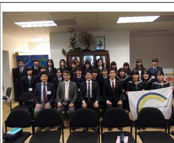
1/24 【Courtesy Call】 Consulate-General of Japan in Houston