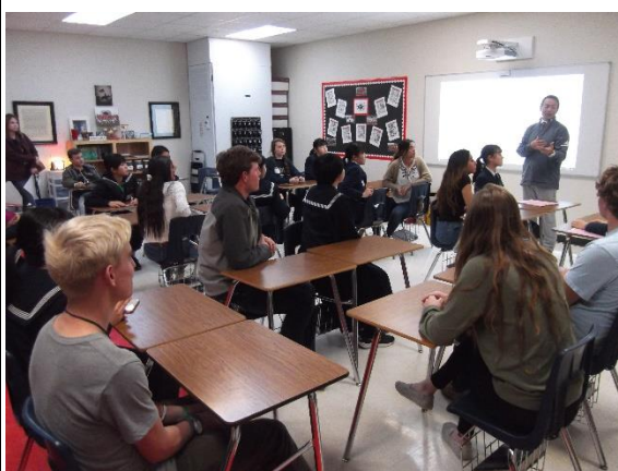
1/25 【School Exchange 2】 Fredericksburg High School