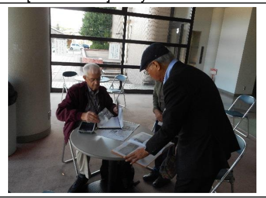
10/12 [Observation] Ex-Fukuoka #23 camp