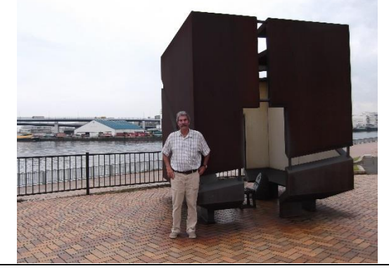
10/11 [Observation] Ex-Kawasaki Steel Company