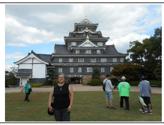
10/12 [Observation] Okayama castle