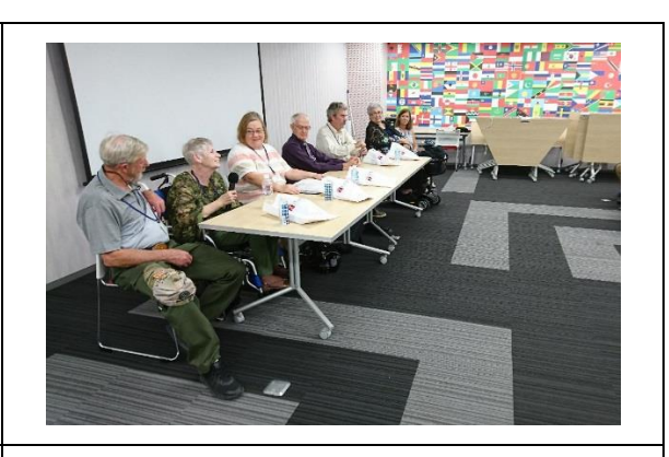
10/10 [Interaction] Temple University