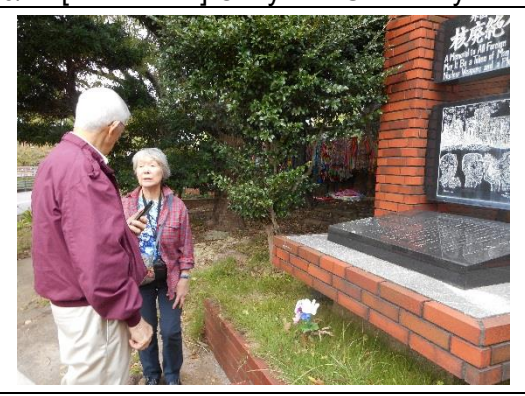
10/11 [Observation] Ground Zero of the Atomic Bombing