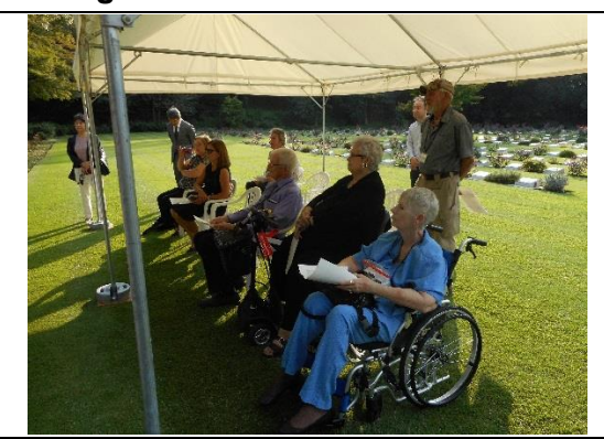
10/9 [Observation] Common Wealth War Cemetery