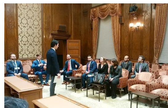
11/19 【Observation】 National Diet Building