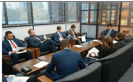
11/19 【Lecture】 Asian and Oceanian Affairs Bureau, Ministry of Foreign Affairs