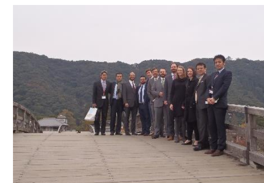
11/21 【Observation】 Kintaikyo Bridge