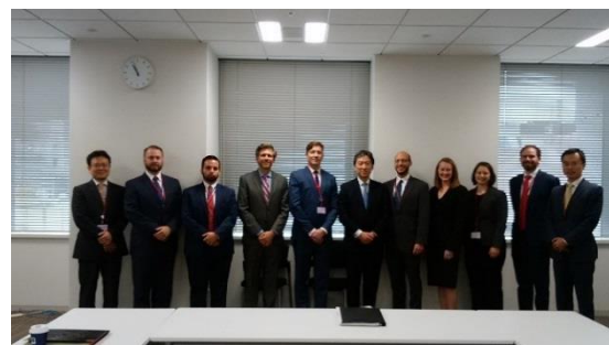
11/19 【Lecture】 Cabinet Office