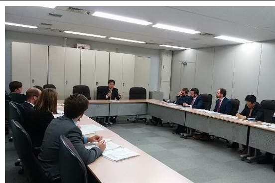
11/19 【Lecture】 Ministry of Economy, Trade and Industry