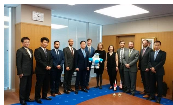
11/21 【Courtesy Call】 Iwakuni City