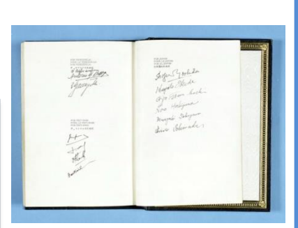
Treaty of Peace with Japan in 1951