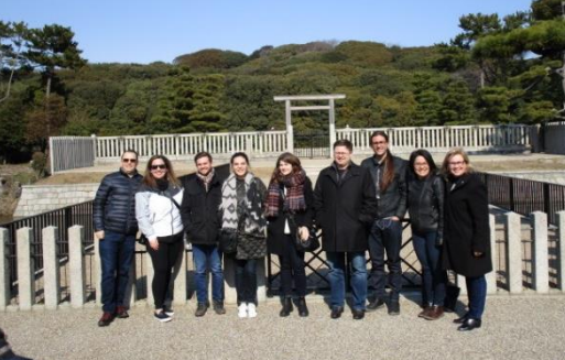
2/8 【Observation】 Nintoku-ryo Tumulus