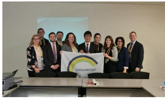
2/5 【Lecture】 Ministry of Foreign Affairs