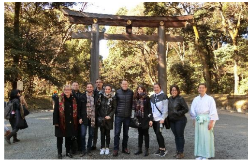
2/6 【Observation】 Meiji Jingu Shrine