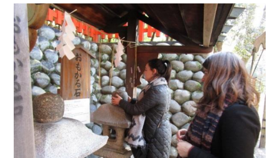
2/9 【Observation】 Fushimi Inari Taisha