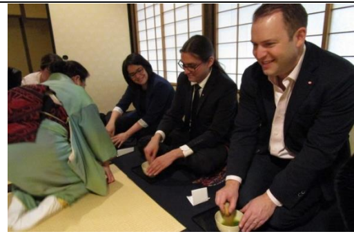
2/7 【Cultural Experience】 Sakai Plaza of Rikyu and Akiko, Tea Ceremony