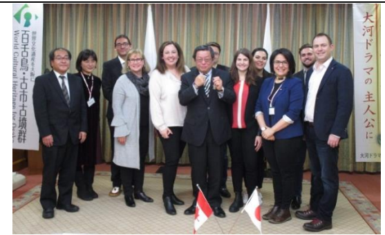
2/7 【Courtesy Call】 Mayor of Sakai city