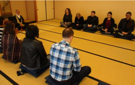
2/9 【Cultural Experience】 Kodaiji Temple, Zazen Experience