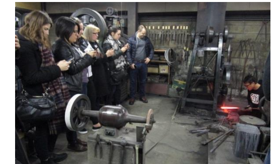
2/8 【Observation】 Enami Blade Factory