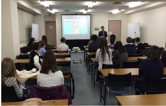
1/23 [Reporting Session] (Tokyo)