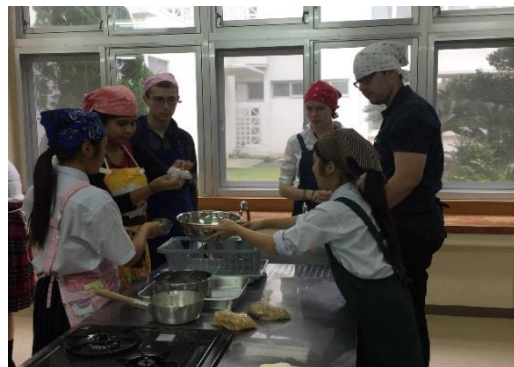
1/20 [School Experience] Kyuyo High School (Okinawa City)