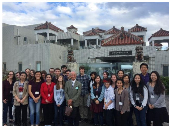
1/19 [Historical Facilities] Okinawa Prefectural Peace Memorial Museum (Itoman City)