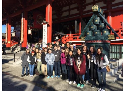
1/24 [Historical Landmark] Asakusa (Tokyo)