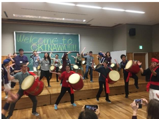
1/19 [Cultural Experience] Eisa dance (Naha City)