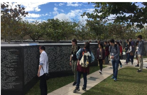
1/19 [Historical Facilities] Peace Memorial Park (Itoman City)