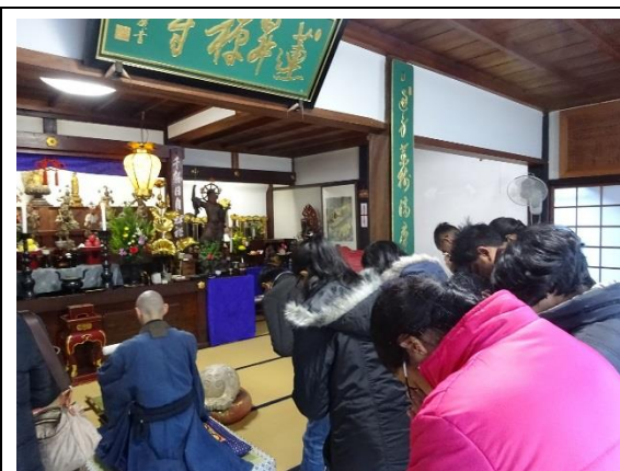
12/2 【Cultural Experience】 Zazen