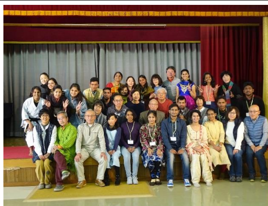
12/3 【Farewell Party with Host Family】