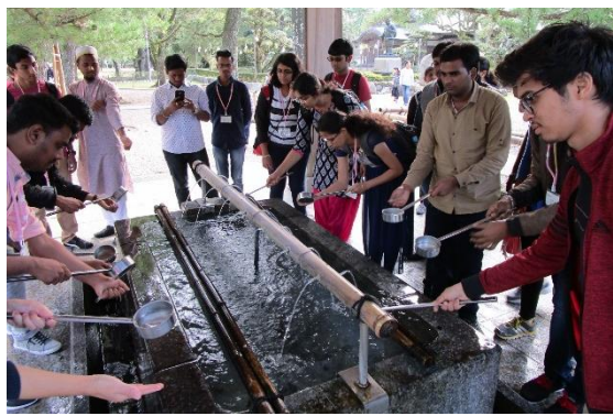
10/27 【Observation of Historical Landmark】 Izumo Taisha Shrine