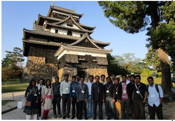
10/26 【Observation of Historical Landmark】 Matsue Castle