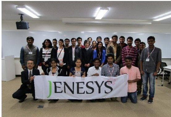
10/27【School Exchange】Shimane University