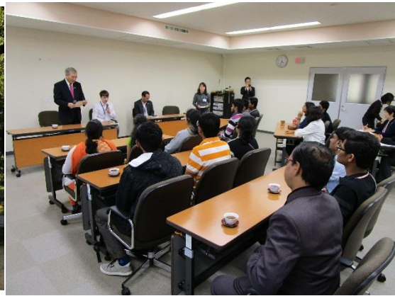
10/26 【Courtesy Call】 Mayor of Matsue City