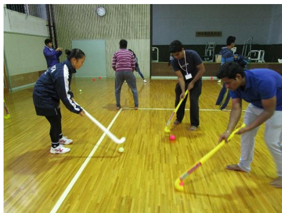
10/29【Sports Exchange】Hockey experience