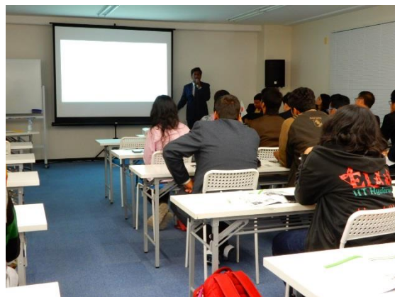
10/30 【Reporting Session】