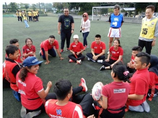
10/11 【Sports Exchange】 Joint training (by country)