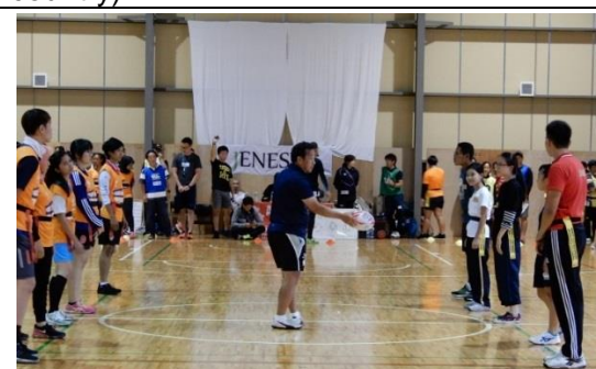
10/13 【Sports Exchange】 Friendly Tag Rugby Match (mixed team, Exchange with Japan team)