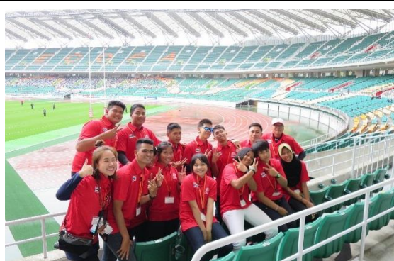
10/14 【Sports Exchange】 Watching Rugby Top League game