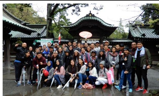
10/13 【Observation of Historical Landmark】 Mishimataisha shrine