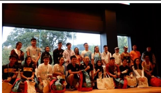
10/13 【Exchange party】