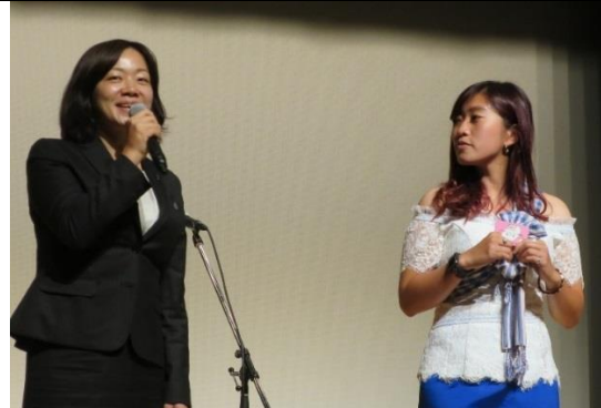
10/16 【Reporting Session】