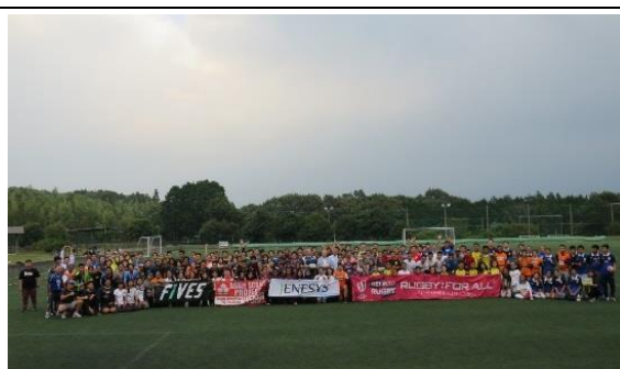
10/12 【Sports Exchange】 Joint Tag Rugby Training (mixed team)