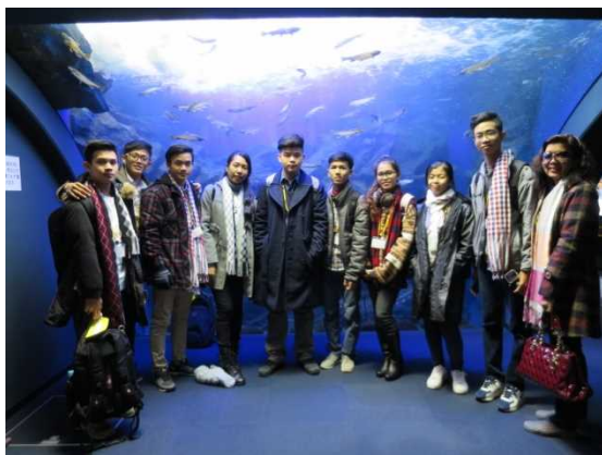
11/27 【自然・環境関連施設視察】 温根湯 「北の大地の水族館 (山の水族館)」

【Film Festival related Event】 Exchange Program Party (After Party)