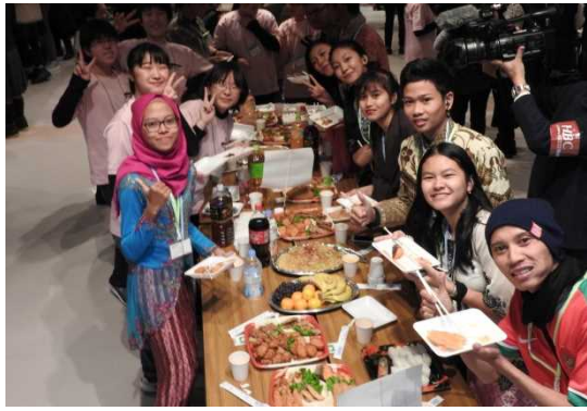
11/25 【映画祭関連イベント】 国内参加者との交流夕食会

【Film Festival Related Event】 Exchange Program and dinner