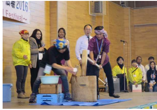
11/26 【映画祭関連イベント】 オホーツク国際ふれあい広場

【Film Festival Related Event】 Exchange Program and dinner