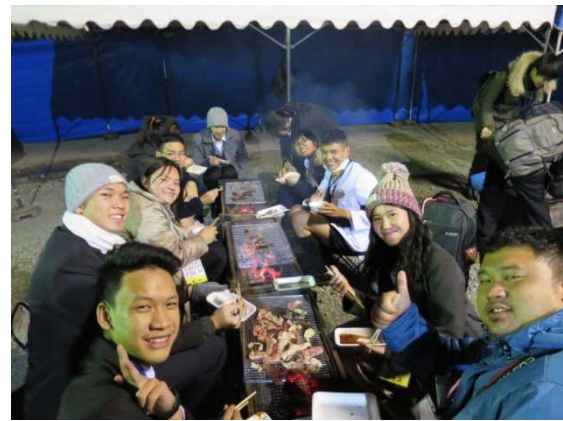
11/26 【映画祭関連イベント】 交流会(アフターパーティー)

【Film Festival related Event】 Exchange Program Party (After Party)