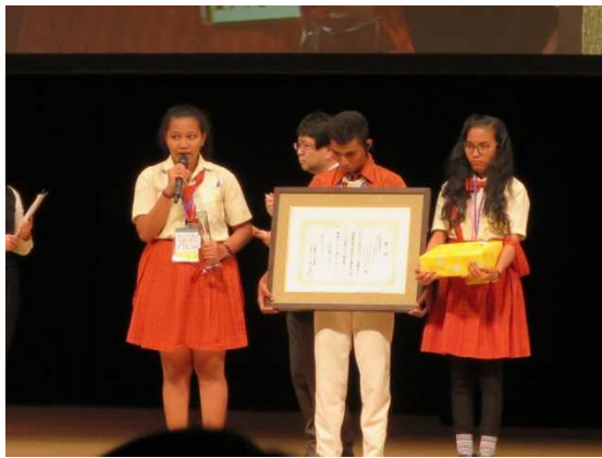
11/26 【映画祭】アジア国際子ども映画祭 (授賞式)

【Film Festival related Event】 ” Okhotsk Kokusai Fureai Hiroba”, International Exchange Event