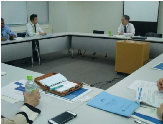
【Lecture】 Ministry of Foreign Affairs/Asian and Oceanian Affairs Bureau (Tokyo)