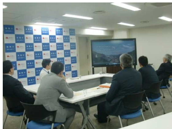
【Lecture】 Reconstruction Agency (Tokyo)