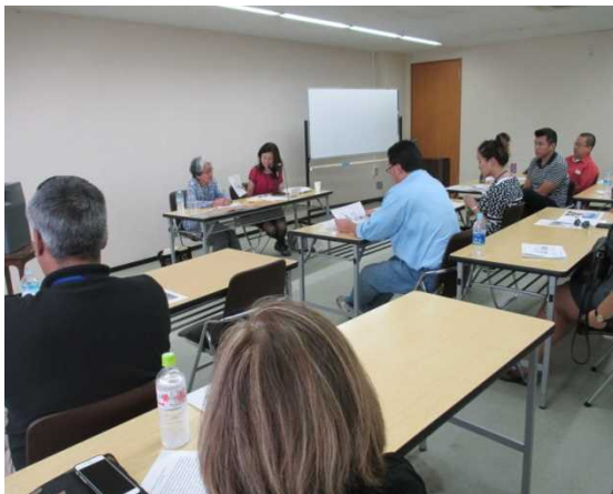
【 Testimony of A-bomb survivor 】 Hiroshima National Peace Memorial Hall for the Atomic Bomb Victims (Hiroshima City)