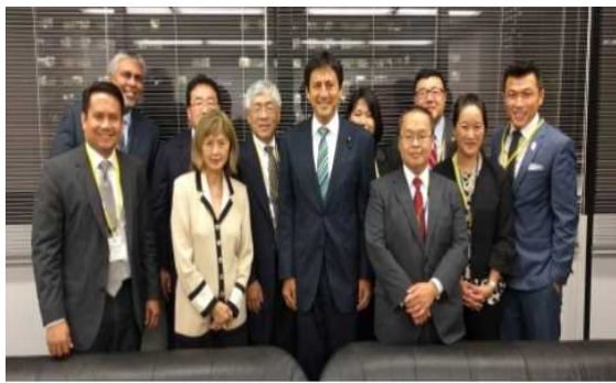
Parliamentary Vice-Minister for Foreign Affairs Takei (Tokyo)