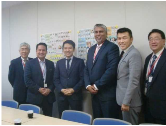
【 Lecture 】 Cabinet Secretariat (Growth Strategy) (Tokyo)