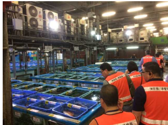
【 Local Industry】 Observation of Tsukiji (Tokyo)