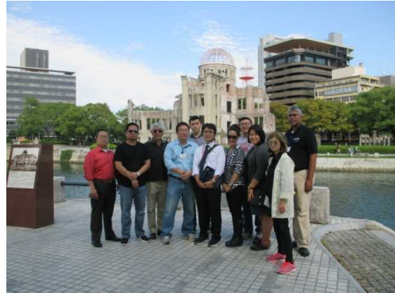
【 Observation of Historical Landmark 】 Hiroshima Peace Memorial Park (Hiroshima City)