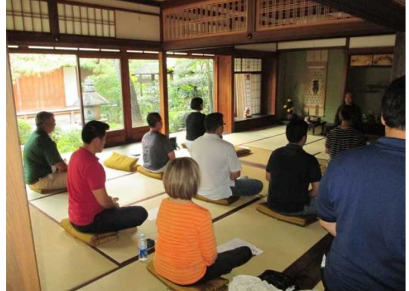
【 Cultural Experience 】 Zen meditation at Taizo-in Temple (Kyoto City)