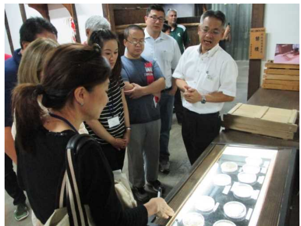
【 Observation of Regional Industry / Company 】 Gekkeikan Okura Sake Museum and sake brewery (Kyoto City)