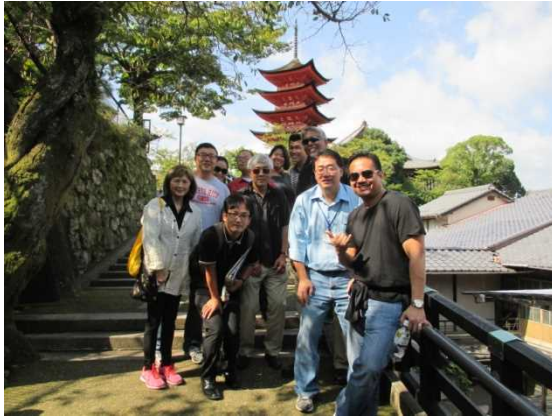
【 Observation of Historical Landmark 】 Miyajima Island and Itsukushima Shrine (Hatsukaichi City)