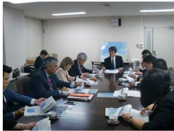
【Lecture】 Cabinet Secretariat/Office of Policy Planning and Coordination on Territory on Sovereignty (Tokyo)