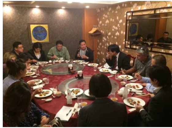
【Reporting】 Exchange of Opinion & Wrap-up with MOFA officers (Tokyo)