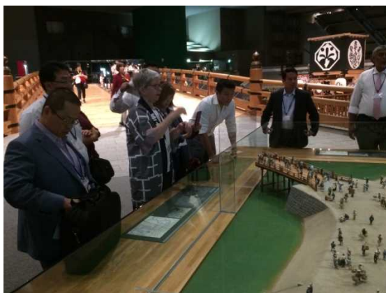
【Observation】 Edo Tokyo Museum (Tokyo)