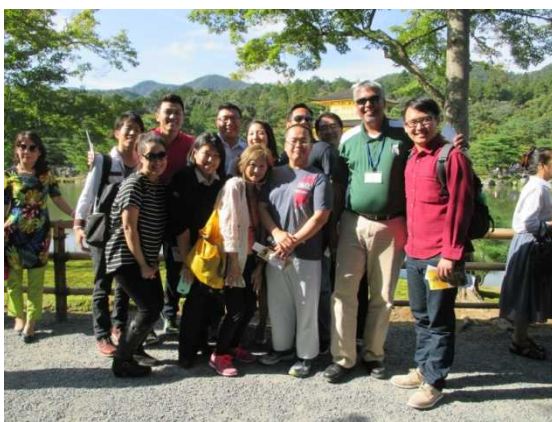
【 Historical Landmark 】 Kinkakuji Temple (Kyoto City)