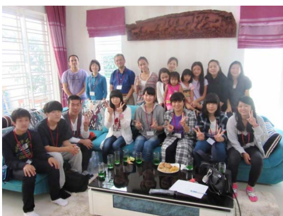
12/6 【Home Visit Program】