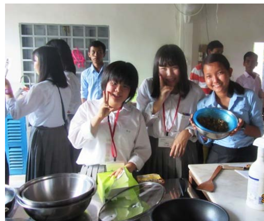
12/4 【School Exchange 2】 Cambodia-Japan Friendship Middle and High school: Demonstrating “Japanese Noodle