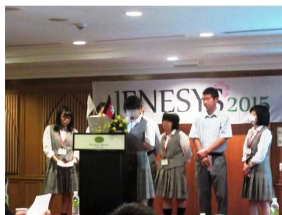
12/8 【Reporting Session】