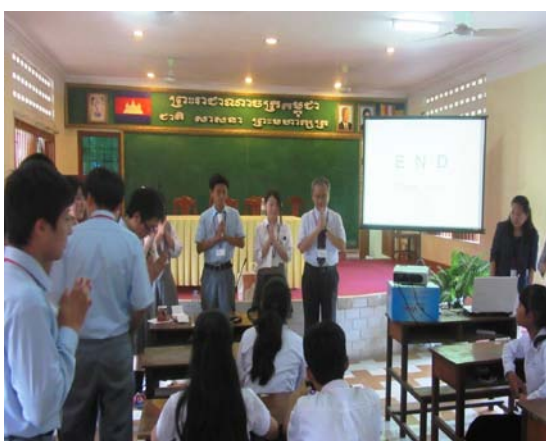
12/3 【School Exchange1】 Bak Touk High School: Introducing “Emergency Food” of Japan