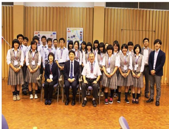
12/2 【Courtesy Call】 Embassy of Japan in Cambodia