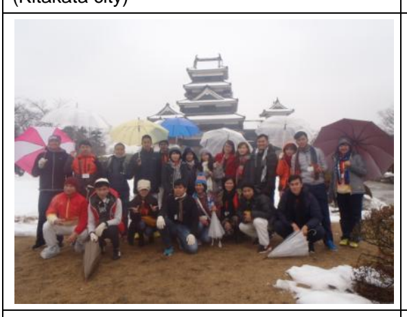
1/29 【History and Culture】 Matsumoto Castle (Matsumoto city)