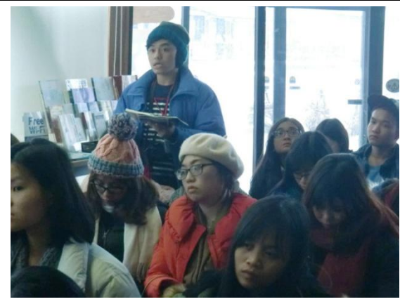
1/29 【Media Exchange】 Kitakata city FM (Kitakata city)