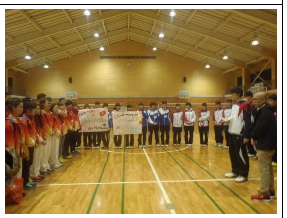
1/29 【School Exchange】 Arigasaki High School(Matsumoto city)