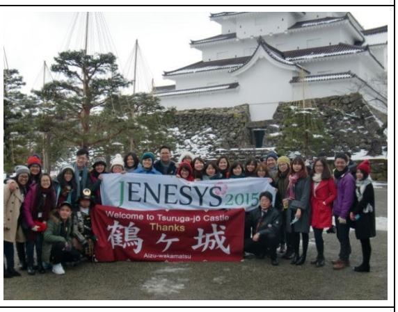
1/31 【History and Culture】 Tsuruga-jo Castle (Aizuwakamatsu city)