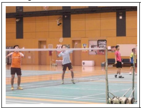
1/28 Badminton Exchange (Tokyo)