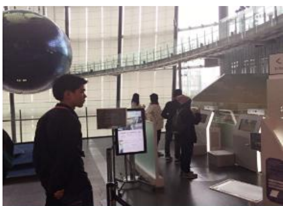
12/1 【Cutting-Edge Technology】 Miraikan - National Museum of Emerging Science and Innovation (Tokyo)

December 8 (Tue) Departure from Narita International Airport