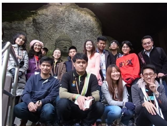
12/3 【History and Culture】 Usuki Sekibutsu (Oita)