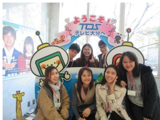
12/4 【Regional Industry】 TOS TV Oita (Oita)