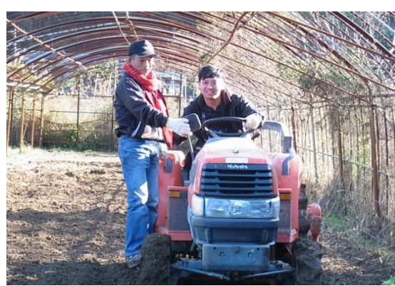
12/5 【Homestay】 (Oita)