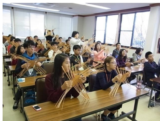
12/3 【History and Culture】 Beppu City Traditional Bamboo Crafts Center (Oita)