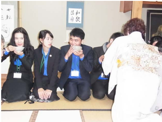
10/30 【Japanese Culture Experience】 Tea Ceremony (Hiroshima)