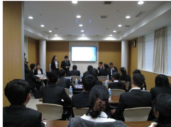
11/2 Reporting Session (Chiba)