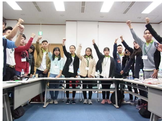
10/29 【History】 Peace Study (Hiroshima)