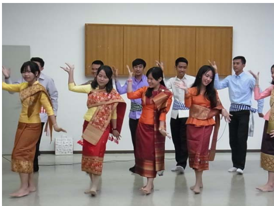
11/1 【Homestay】 Farewell Party (Hiroshima)