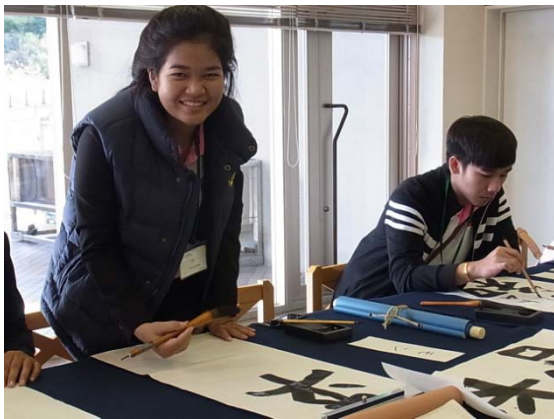
10/28 【Japanese Culture Experience】 Calligraphy (Hiroshima)