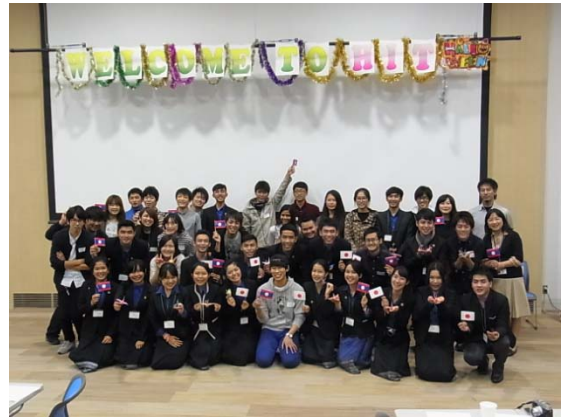
10/30 【School Exchange】 Hiroshima Institute of Technology (Hiroshima)