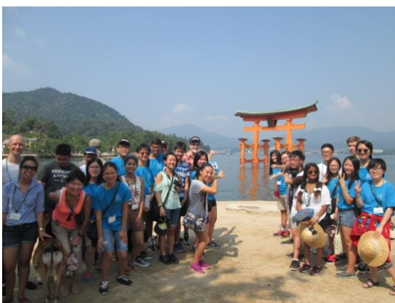
8/4 【視察】宮島 / 厳島神社

【Observation】 Hiroshima Peace Memorial Park