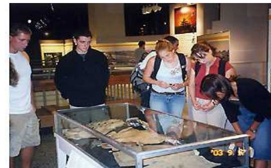
Atomic Bombing Exhibitions