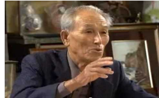
Testimony of Hibakusha