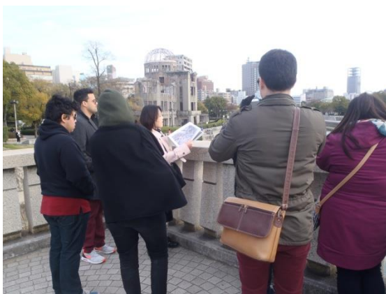
3/25 【History】 Hiroshima Peace Memorial Park, Atomic Dome and Museum (Hiroshima City)