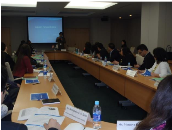
3/24 【Lecture on US-Japan relationship】 MOFA (Tokyo)