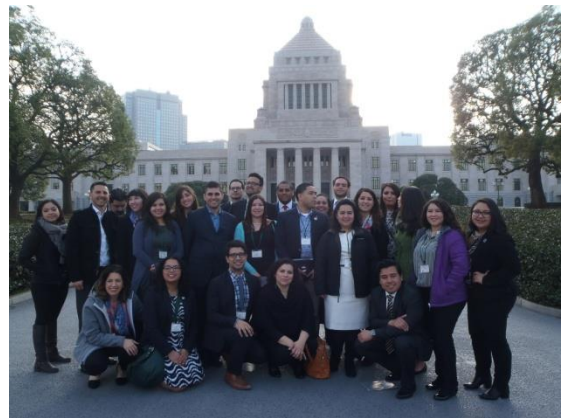
3/24 【Observation】 National Diet Building (Tokyo)