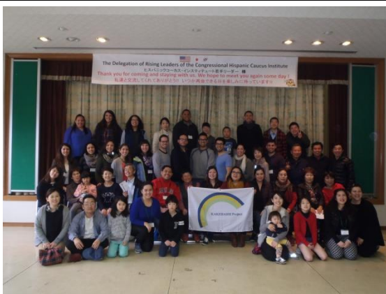
3/26~27 【Farm stay】 (Akiota)