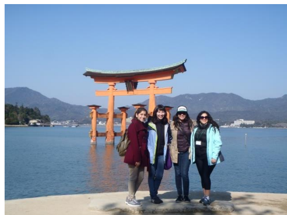
3/26 【Observation of Historical Landmark】 Miyajima Itsukushima Shrine (Hatsukaichi City)