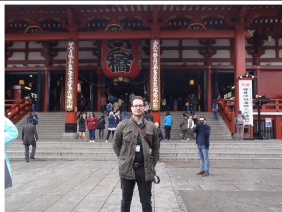
3/28 【Historical】 Asakusa Sensoji Temple (Tokyo)