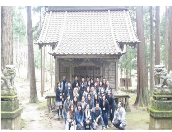
3/18 【Local Industry/Experience Traditional Culture】 Nomura Agriculture Inc.(Komatsu City)