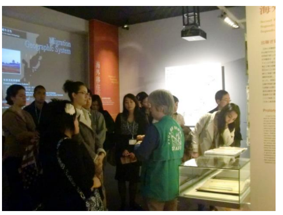
3/16 【Lecture on Japan】 Cabinet Office (Tokyo)