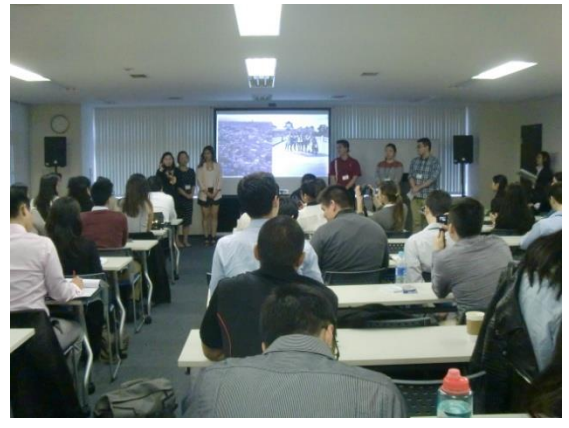
3/21 【Reporting Session】 (Tokyo)