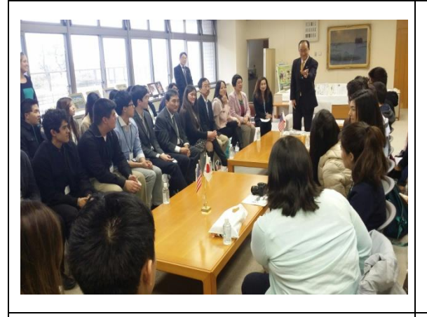
3/18 【Courtesy Call】 Komatsu City Hall (Komatsu City)