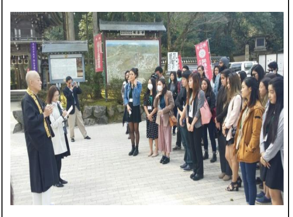
3/18 [Observation of Historical Architecture] Nata Temple (Komatsu City)