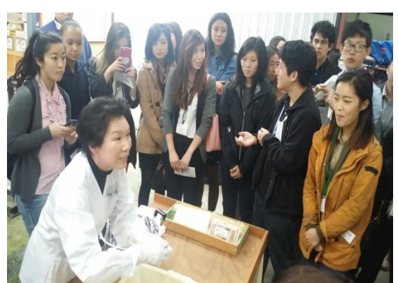
3/18 【Local Industry/Experience Traditional Culture】 Nomura Agriculture Inc.(Komatsu City)