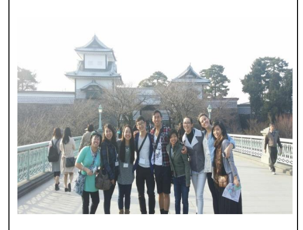
3/17 [Observation of Historical Architecture] Kanazawa Castle Park (Kanazawa City)