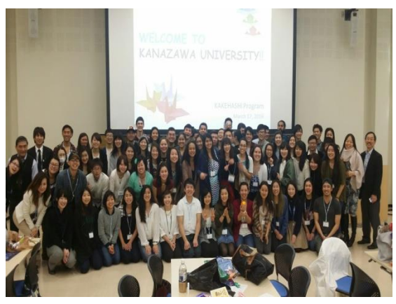
3/17 [School Exchange] Kanazawa University (Kanazawa City)