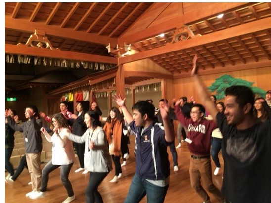
1/15 【Traditional Cultural Experience】 Ohori Park Noh Theater (Fukuoka City)