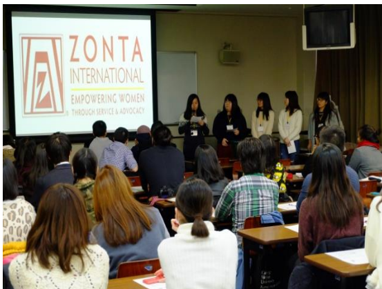
1/14 【School Exchange】 Miyagi Gakuin Women's University (Sendai City)