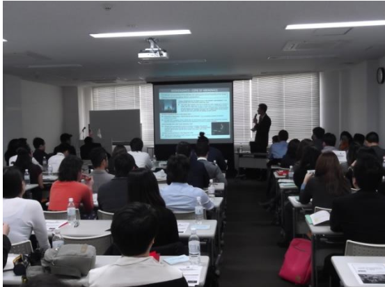
1/13 【Lecture on Japan】 Cabinet Office (Tokyo)