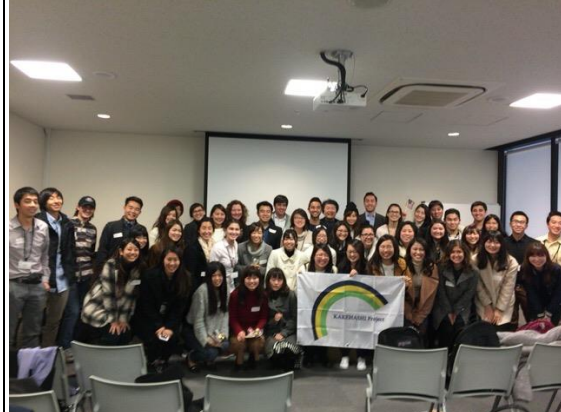
1/14 【School Exchange】 Seinan Gakuin University (Fukuoka City)