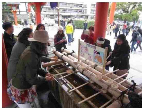
12/18 【History and Culture】 Fushimi Inari Taisha Shrine (Kyoto city)