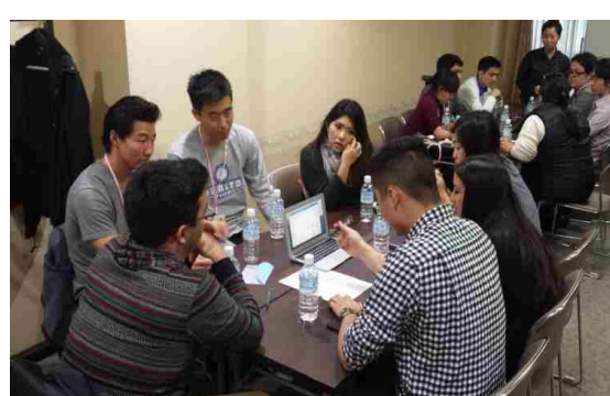
12/20 【Workshop】 (Fukuoka city)