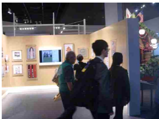
12/16 【Observation】 Japanese Overseas Migration Museum (Tokyo)