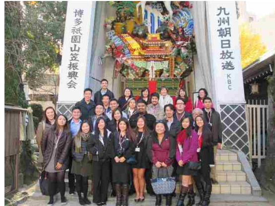
12/18 【History and Culture】 Kushida Shrine (Fukuoka city)