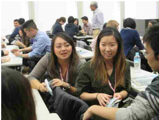
12/18 【School Exchange】 Fukuoka University (Fukuoka city)