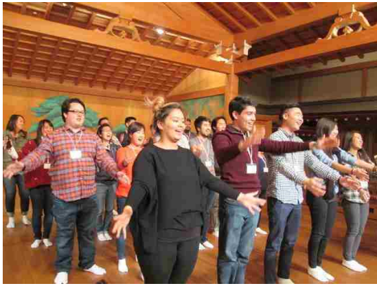
12/17 【History and Culture】 The Ohori Park Noh Theater (Fukuoka City)