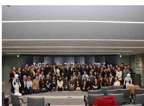
12/2 【Observation】 IBM Japan Ltd.(Tokyo)