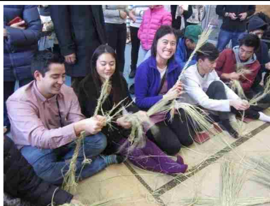
12/19 【Homestay】 (Higashi-omi city)