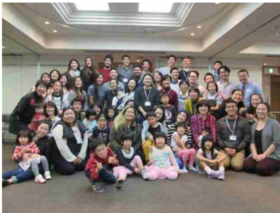
12/20 【Homestay】 Farewell party (Fukuoka city)