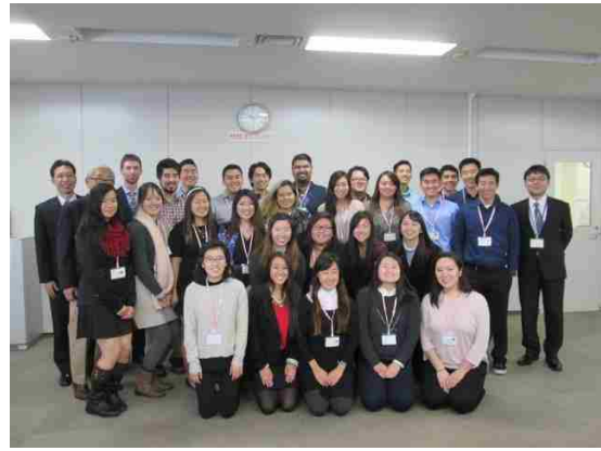
12/18 【Courtesy Call】 Fukuoka City (Fukuoka city)