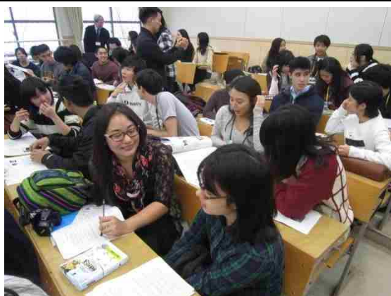
12/18 【School Exchange】 The University of Shiga Prefecture (Hikone city)