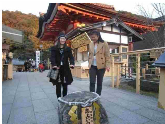
12/17 【History and Culture】 Kiyomizu-dera Temple (Kyoto city)