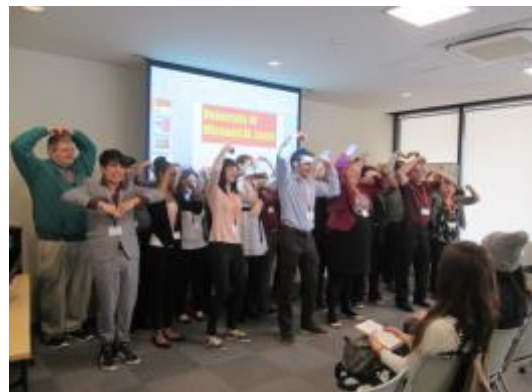
3/17 【School Exchange】 Seinan Gakuin University (Fukuoka City)