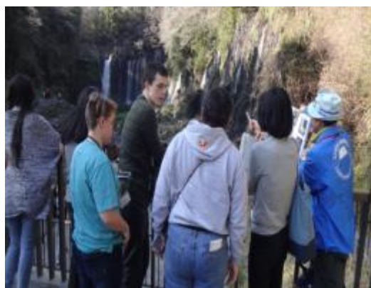
3/17 【Nature】 Shiraito Falls (Fujinomiya City)