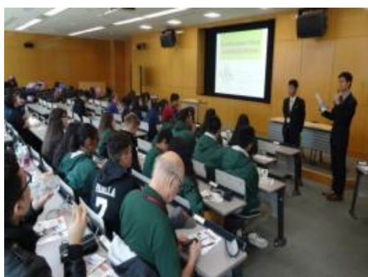
3/18 【Courtesy Call／Introduction of the Region】 Mishima City Hall (Mishima City)