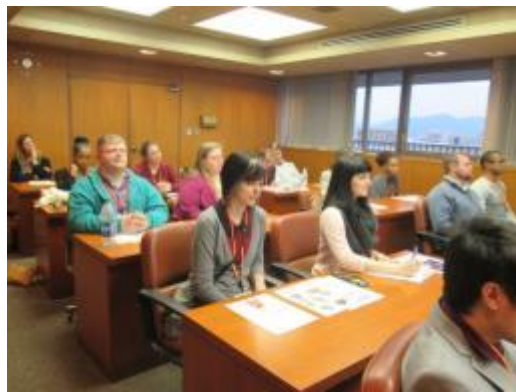
3/17 【Courtesy Call / Introduction of the Region】 Fukuoka Prefectural Governmental Office (Fukuoka City)