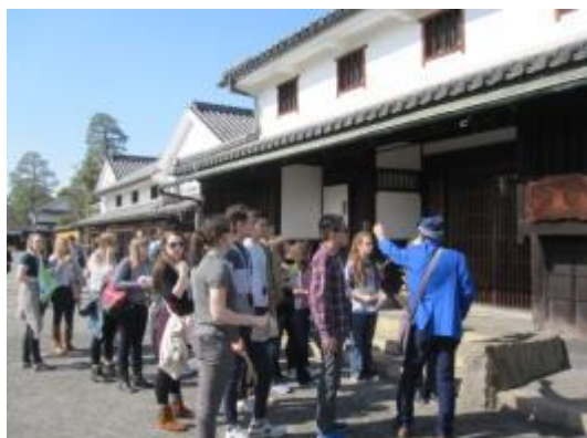
3/17 【History／Traditional Culture】 Kurashiki Bikan Quarter(Kurashiki City)