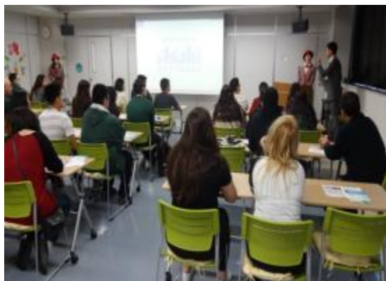
3/17 【Regional Industry】 ASAHI SOFT DRINKS CO., LTD. Fujisan Factory (Fujinomiya City)