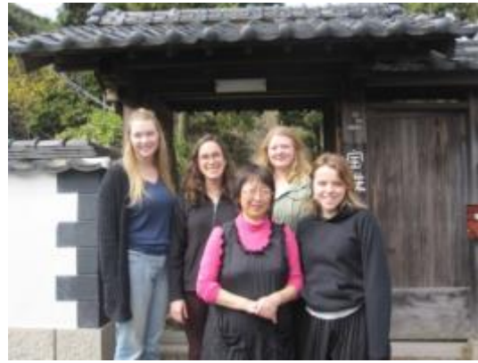
3/19 【Homestay】 (Setouchi City)