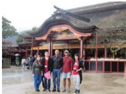
3/18 【Observation of Historical Landmark】 Dazaifu Tenmangu Shrine (Dazaifu City)