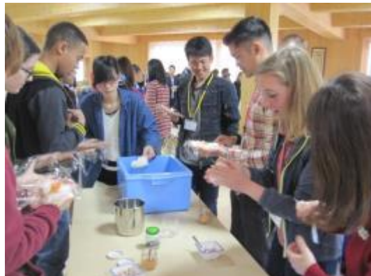
3/18 【School Exchange】 Kibi International University Okayama Campus (Okayama City)