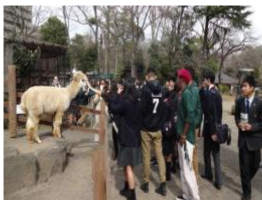
3/18 【School Exchange】 Nihon University Mishima Senior High School (Mishima City)