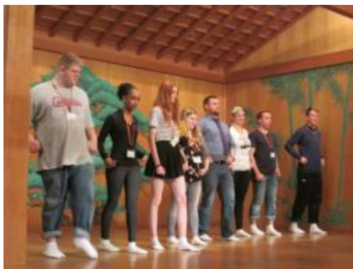
3/18 【Cultural Experience】 Ohori Park Noh Theater (Fukuoka City)