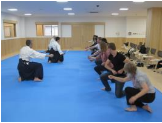
3/18 【School Exchange】 Kibi International University Okayama Campus (Okayama City)