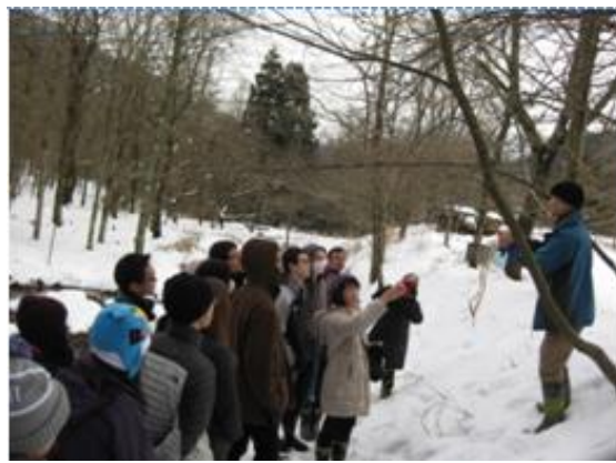
1/23 【Farm stay / Exchange program】Forest walking (Takashima City) (A・B Group)