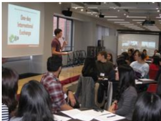
1/22 【School Exchange】Doshisha University (Kyoto City) (A・B Group)