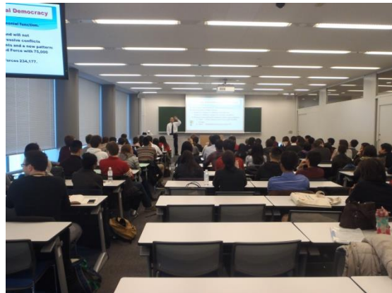
1/20 【Lecture on Japanese Culture／Key Note Lecture】 (Tokyo)