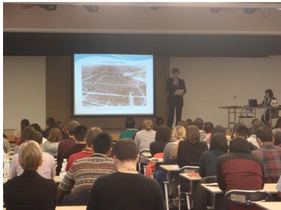
1/20 【Lecture on Japan】 (Tokyo)