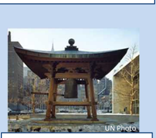
The Peace Bell donated by Japan in 1954 is installed at the Japanese Garden in the UN Headquarters