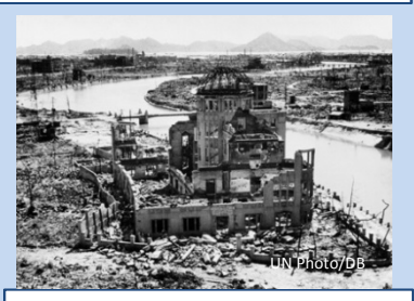
The Hiroshima Peace Memorial registered as UNESCO's World Heritage site