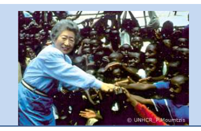
Ms. Sadako Ogata visited numerous areas of conflict as the UN High Commissioner for Refugees and devoted herself to supporting refugees.

(2)World Health Organization (WHO) ••• The WHO is the agency which aims to improve health standards for people all over the world. In recent years, infectious diseases such as the Middle East respiratory syndrome (MERS) and the Ebola Virus Disease have broken out. As globalization gains momentum today, it is impossible for a single country to handle infectious diseases. The WHO responds to the challenges. To fight against Ebola Virus Disease, Japan offered a wide array of support in cooperation with WHO, and also provided medical equipments and protective garments, and deployed experts through bilateral cooperation.