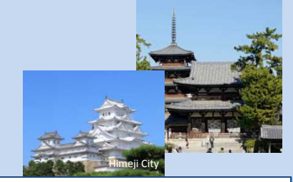
Japan's first UNESCO World Heritage sites, the world's oldest wooden structure Horyu-ji Temple and the Himeji-jo Castle well-known as the White Heron Castle were registered in 1993.