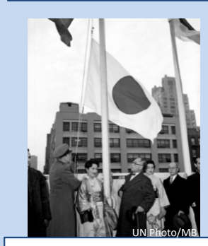
Foreign Minister Mamoru Shigemitsu witnesses the hoisting of the national flag upon Japan's accession to the UN (1956)