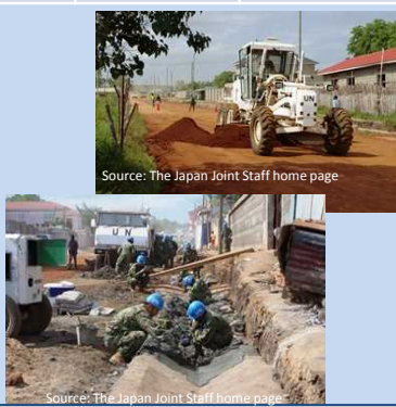
JSDF takes part in PKO in South Sudan (road construction activities in the capital Juba).