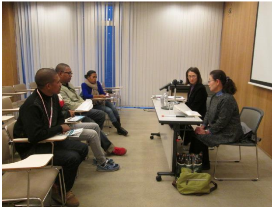
2/11 【Lecture】 Discourse by oral story teller of atomic bombs experience/Discussion (Hiroshima City)