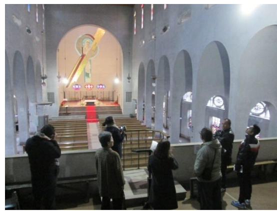
2/12 【Observation of Historical Landmark】 Memorial Cathedral for World Peace (Hiroshima City)