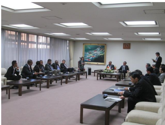
2/10 【Local Exchange】 Exchange with Hiroshima City Council members (Hiroshima City)