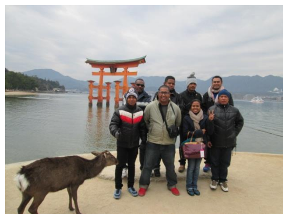
2/12 【Observation of Historical Landmark】 Itsukushima-jinja Shrine in Miyajima (Hatsukaichi City)