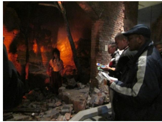
2/12 【Observation of Historical Landmark】 Hiroshima Peace Memorial Museum (Hiroshima City)