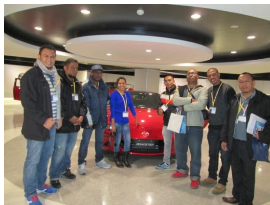
2/11 【Regional Industry】 Mazda Museum (Aki gun)