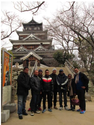
2/12 【Observation of Historical Landmark】 Hiroshima Castle (Hiroshima City)