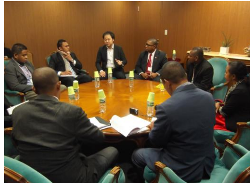
2/9 【Lecture】 Japan Institute of International Affairs (Tokyo)