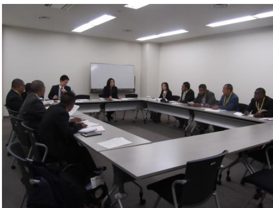
2/9【Courtesy Call】Ministry of Foreign Affairs (Tokyo)