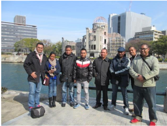
2/11 【Observation of Historical Landmark】 Hiroshima Peace Memorial Park (Hiroshima City)