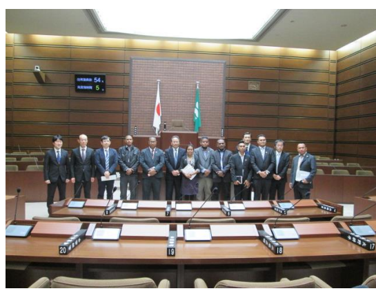
2/10 【Observation】 Hiroshima City Council Hall (Hiroshima City)