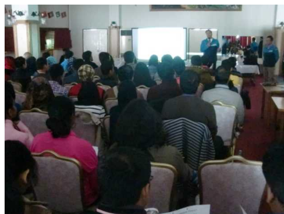
3/10 Introduction of the Region : Minamiyama Kanko (Minamiaizu Town)