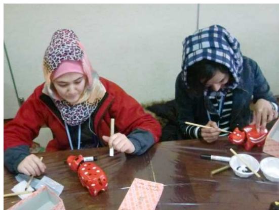
3/11 Cultural Experience : Akabeko painting (traditional toy of red cow) (Aizuwakamatsu city)