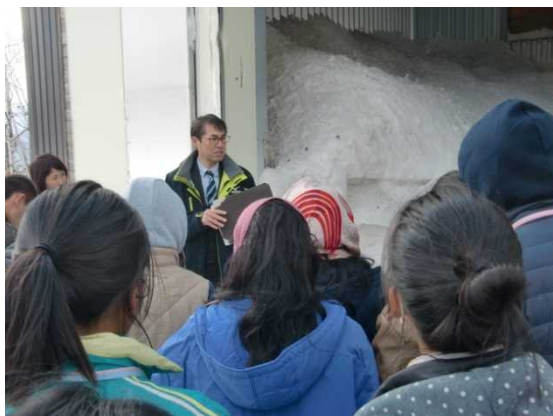
3/10 Environment : Biomass boiler, Renewable energy by utilizing snow (Minamiaizu Town)