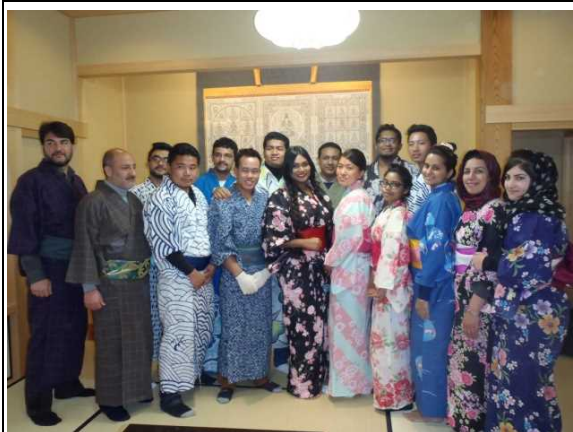
3/11 Cultural Experience : Tea Ceremony, Kimono Wearing (Kamogawa city)