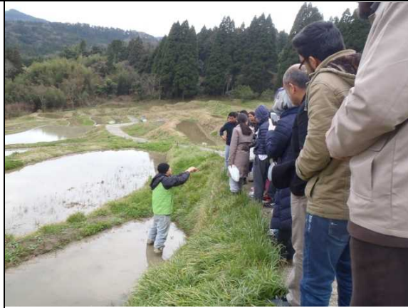
Farm Experience : Oyama Senmaida (Kamogawa city)