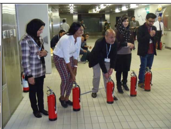
3/8 Disaster Prevention : Tachikawa Disaster Prevention Center (Tokyo)