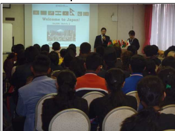
3/8 Orientation (Tokyo)