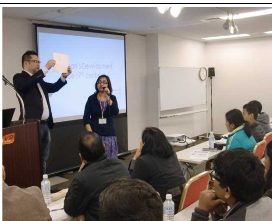
3/9 Lecture on Japanese Culture／Key Note Lecture (Tokyo)