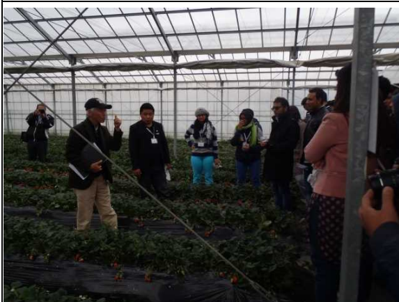
3/13 Farm Experience : Strawberry Picking (Kamogawa city)