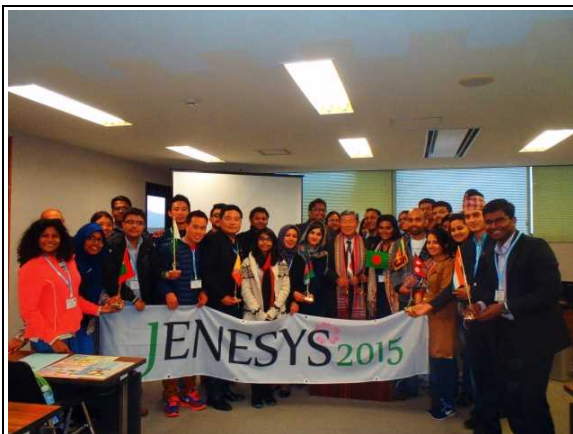
3/9 Courtesy Call : Mayor of Kamogawa city / Lecture : Disaster Prevention and Environment (Kamogawa City)