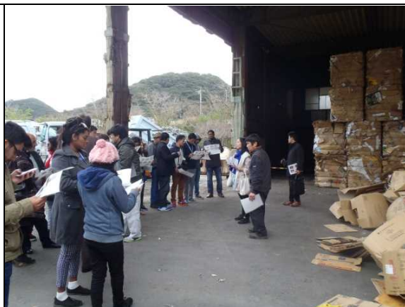
3/10 Environment : Certified as one of the best industrial waste trader by Ministry of Environment (Kamogawa city)