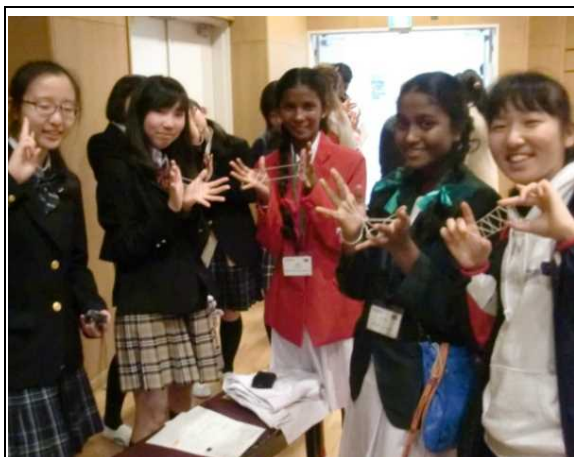
3/8 School Exchange : Toyama High School (Tokyo)