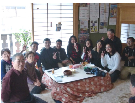
3/12 Home stay (Minamiaizu Town)