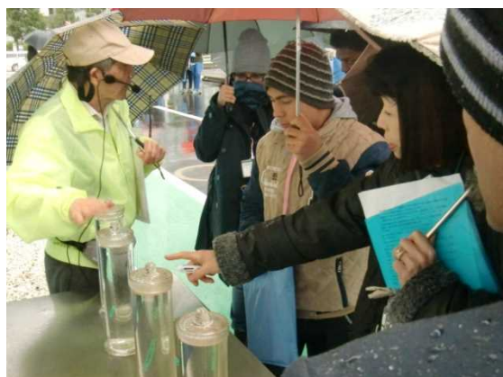
3/9 Environment : Shibaura Water Reclamation Center (Tokyo)