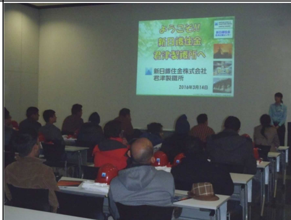
3/14 Environment/Cutting-edge Technology : Kimitsu Plant, Nippon Steel & Sumitomo Metal Co. (Kimitsu city)