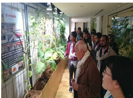
3/14 Environment : Pasona Urban Farm (Tokyo)