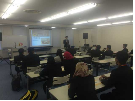
3/21 Reporting session (Matsushima Town)