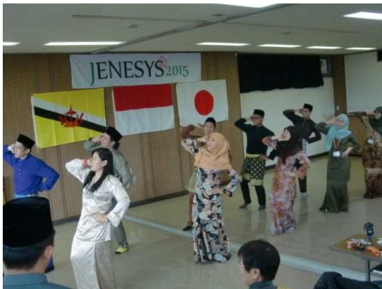
3/20 Farewell Party with Host Family (Kami Town)