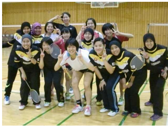
3/17 School Exchange: St. Ursula Gakuin Eichi High School (Sendai City)