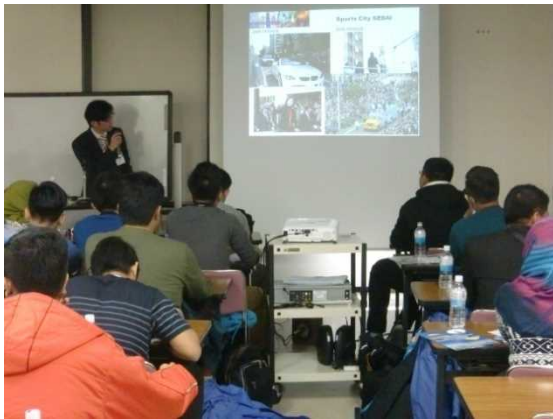
3/18 Introduction of the Region: Sendai Municipal Government (Sendai City)