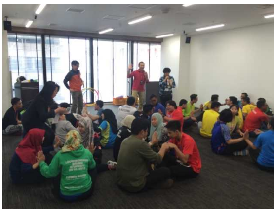
3/16 Key note lecture (Tokyo)