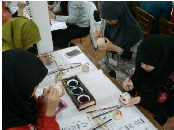
3/18 Cultural Experience: Kokeshi Doll Painting (Matsushima Town)