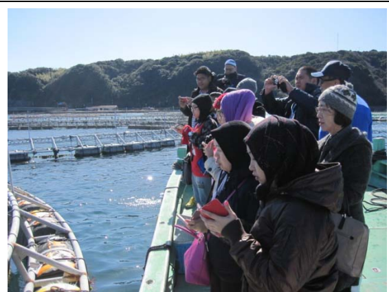
2/25 【 Observation 】 Fisheries Laboratory, Kinki University (Higashimuro District)