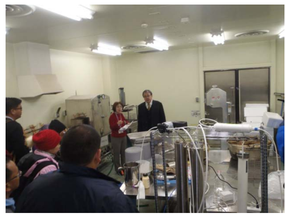
2/23 【 Observation/Lecture 】 National Research Institute of Fisheries Science, Fisheries Research Agency (Yokohama City)