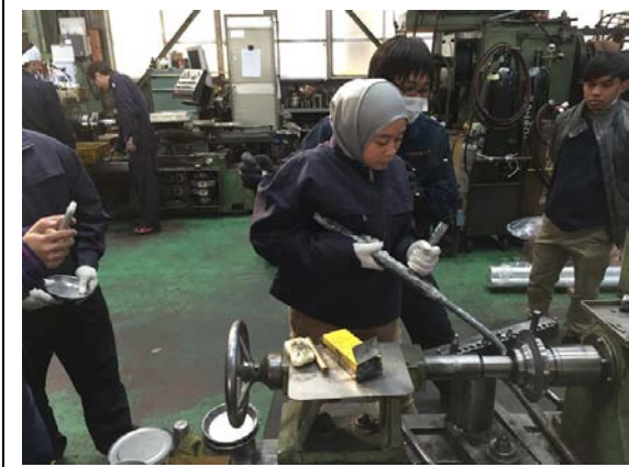
2/23 【 Observation 】 Kitajima Shibori Seisakusho Co., Ltd. (Tokyo)