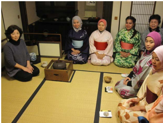
2/27 【Home stay】 (Hidaka District)