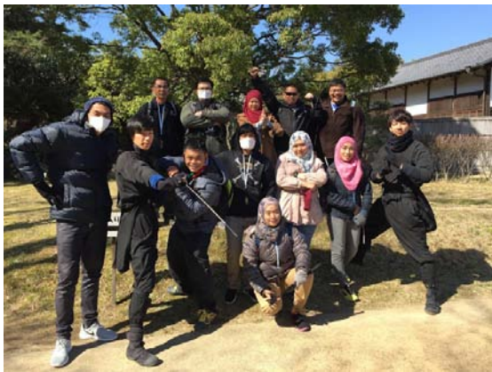
2/25 【Observation of Historical Landmark】 Wakayama-jo Castle (Wakayama City)