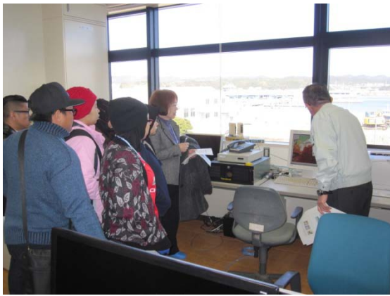
2/25 【 Observation/Lecture 】 Wakayama Prefectural Fisheries Experiment Station (Higashimuro District)