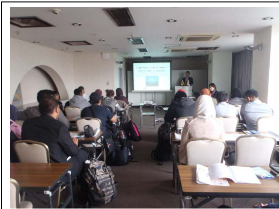
2/22 Program Orientation (Tokyo)