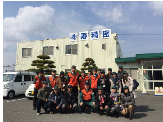
2/26 【Local Industry】 KOTOBUKI Precision (Ito District)