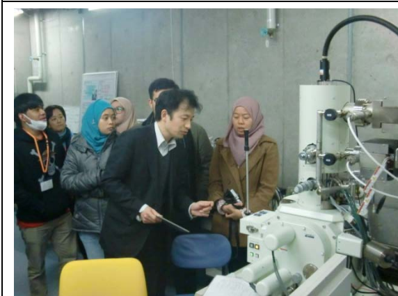
2/24 【School Exchange】 Osaka Prefecture University (Habikino city)