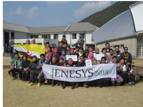
2/28 【Farewell Party】 (Hidaka District)