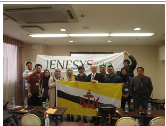
2/23 【Key Note Lecture】 (Tokyo)