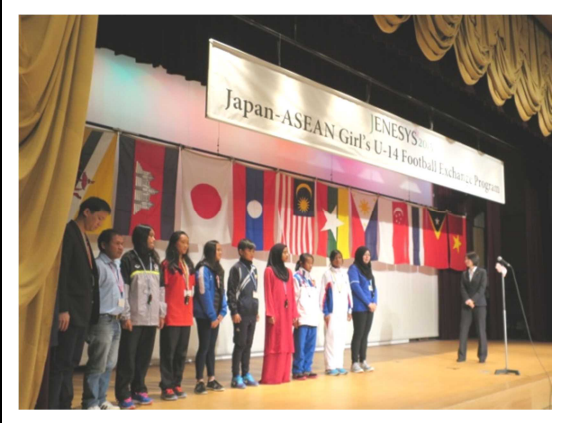
3/14 Reception (Gotemba City)