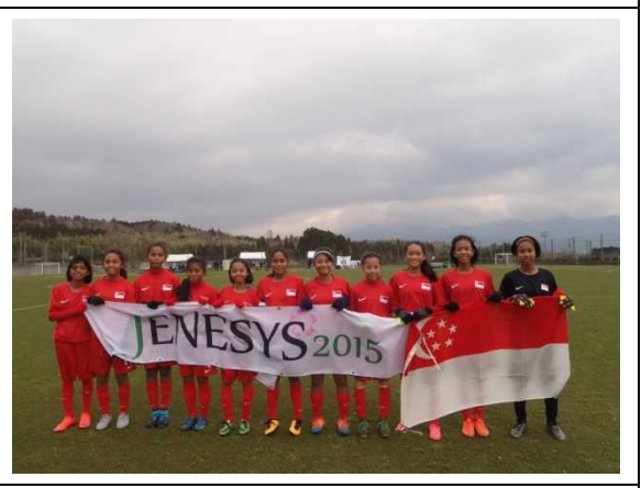
3/12-16 Football Exchange Match (Gotemba City, Singapore)