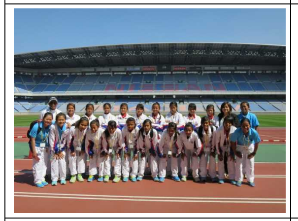
3/17 Observation, Nissan Stadium (Yokohama City)