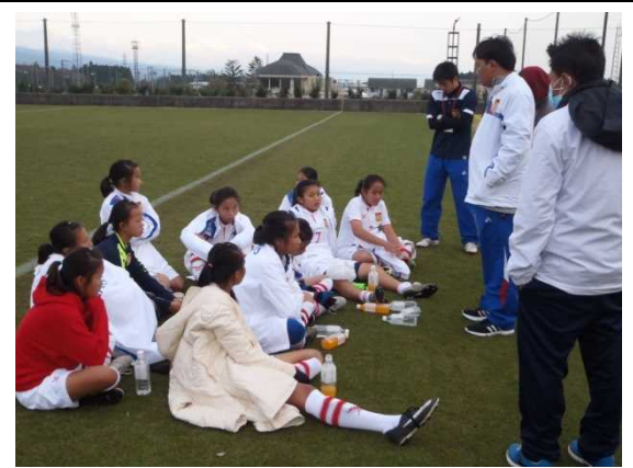
3/12-16 Football Exchange Match (Gotemba City, Laos)