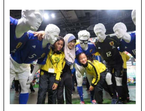
3/17 Observation, Japan Football Museum (Tokyo)