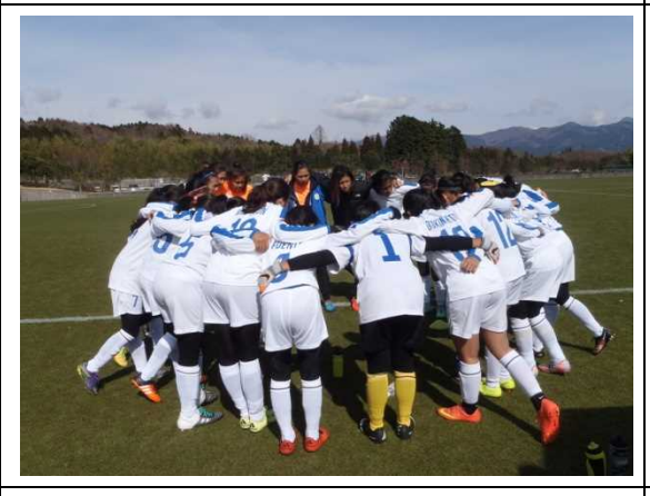
3/12-16 Football Exchange Match (Gotemba City, Philippines)