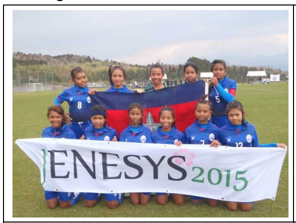
3/12-16 Football Exchange Match (Gotemba City, Cambodia)