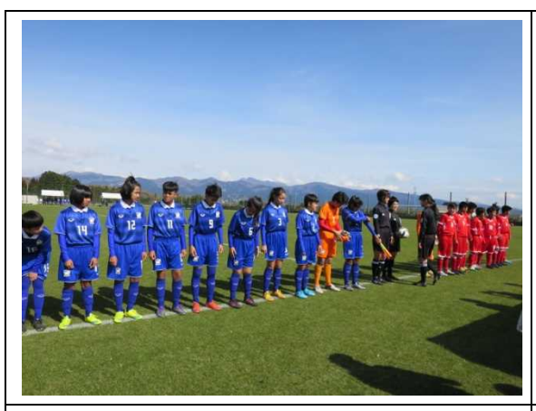
3/12-16 Football Exchange Match (Gotemba City)