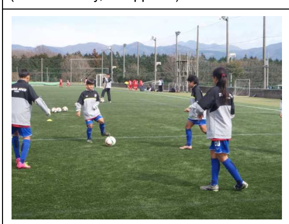
3/12-16 Football Exchange Match (Gotemba City, Thailand)