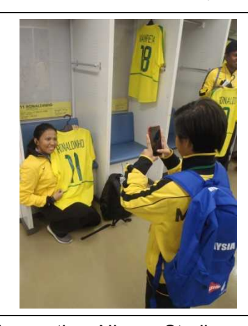
3/17 Observation, Nissan Stadium (Yokohama City)