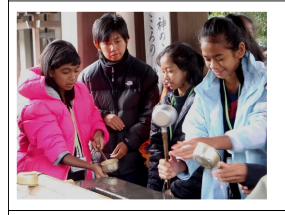
3/12 Observation of Historical Landmark, Mishima Grand Shrine (Mishima City)