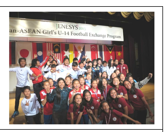
3/14 Reception (Gotemba City)