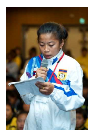
3/17 Courtesy Call, Ministry of Foreign Affairs (Tokyo)