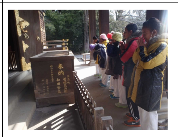
3/12 Observation of Historical Landmark, Mishima Grand Shrine (Mishima City)