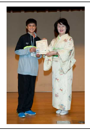
3/17 Presentation of Certificate (Tokyo)