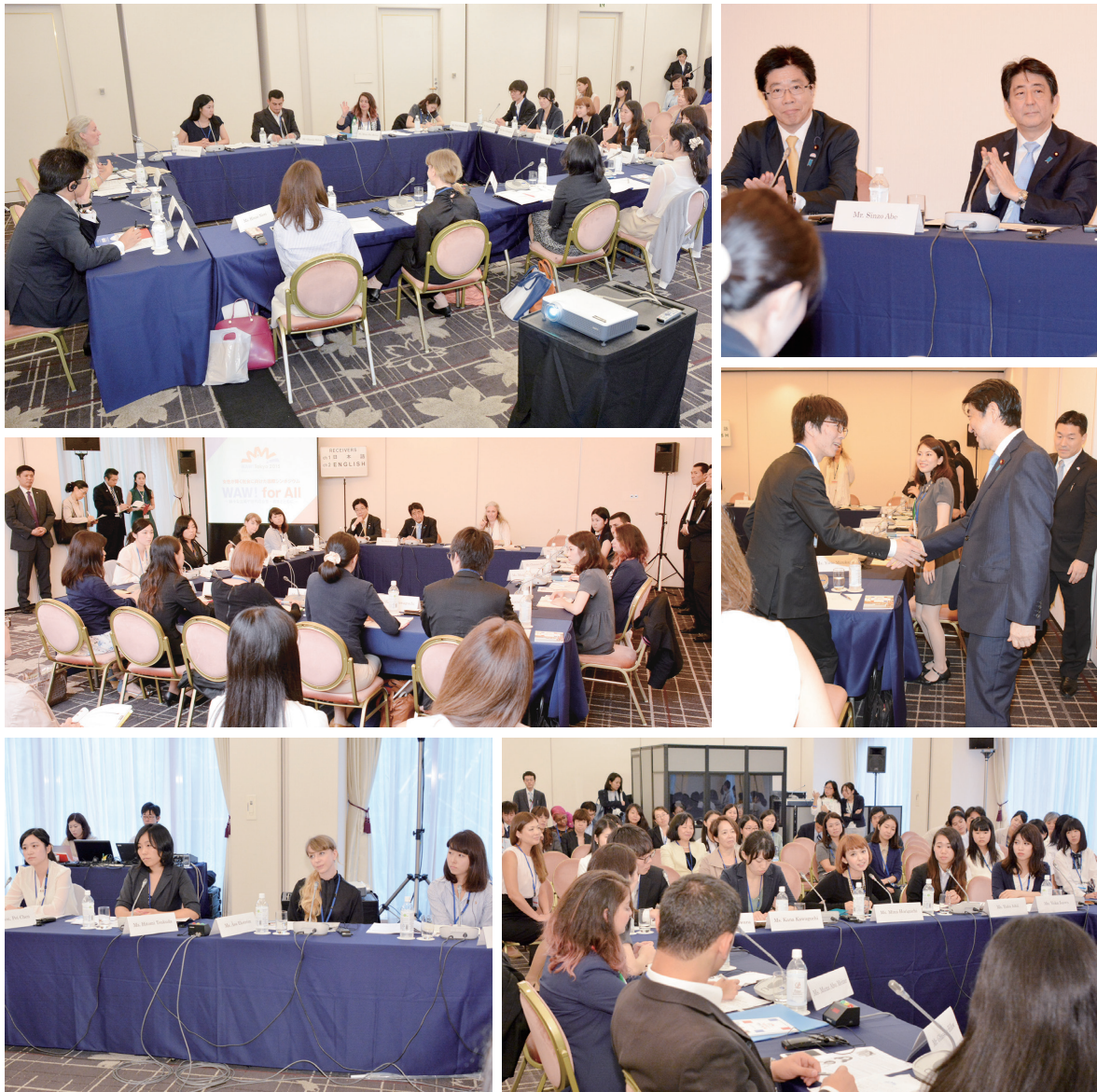
View of the Venue

In addition, the participants from Jordan and Palestine presented on the importance of providing more opportunities for youth to voice their perspectives and opinions, since they have limited access to information and people just because they are young.