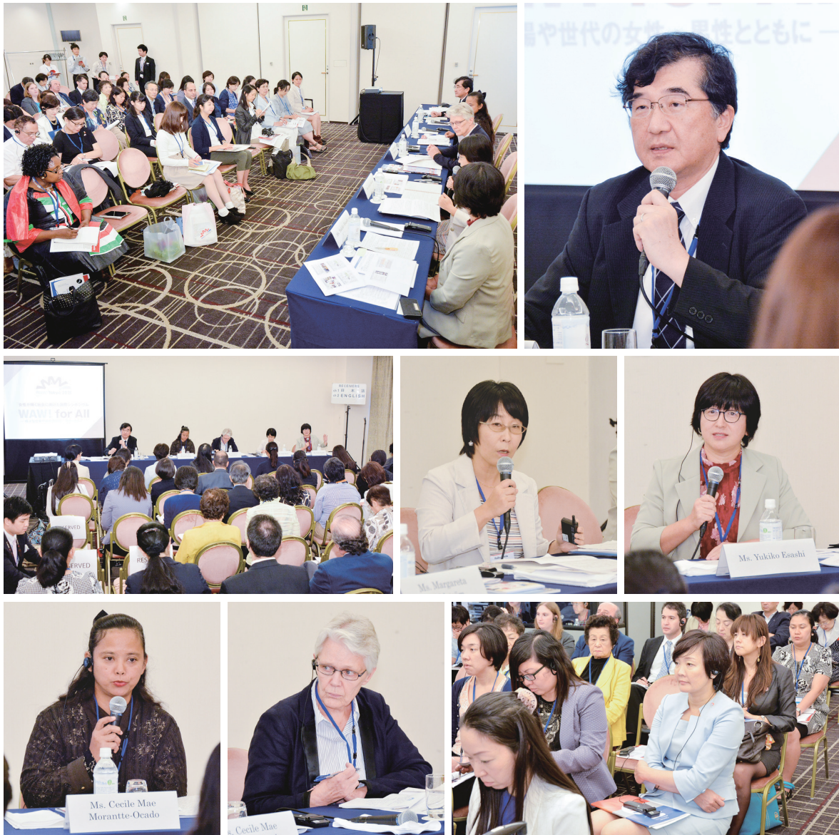
View of the Venue

They shared the importance of ensuring that men and women of all ages are able to participate in every aspect of decision making in disaster risk reduction, in creating concrete countermeasures, and in consideration of the whole disaster cycle from prevention to reconstruction in order to encourage women's leadership.