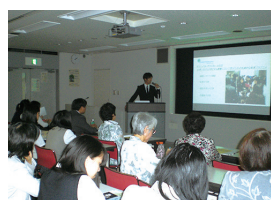
“Education for the girls in the world! High school students invocation” on September 22, 2015 (Organizer: Japan National Committee for UN Women)