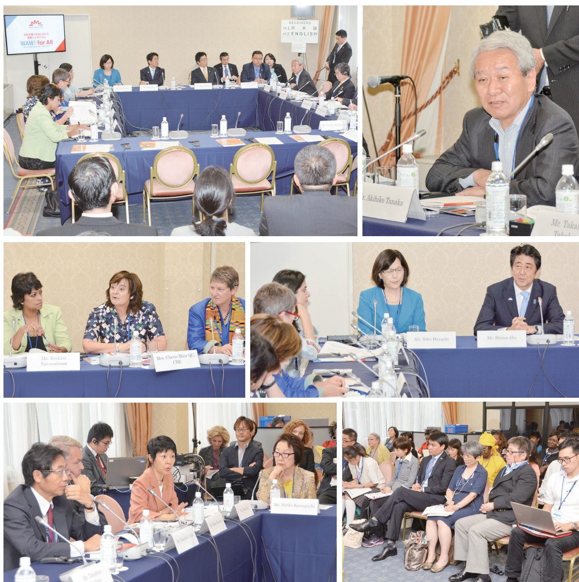
View of the Venue

Utilizing technologies are also effective, for instance, mobile banking and cell phones. There are successful cases of services and products which started from the developed countries, which are locally suitable.