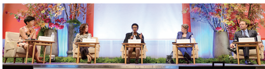
Panel Discussion Economy