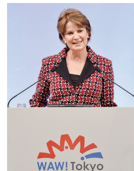
Marillyn A. Hewson, Chairman, President and Chief Executive Officer, Lockheed Martin Corporation

The second speaker was Marillyn A. Hewson, CEO of Lockheed Martin, who started her career at Lockheed Martin and became CEO by breaking through what is known as the "glass ceiling." Based on her experience at Lockheed Martin, she discussed how to create a company culture in which everyone can fulfill their ability. In addition, she sent out a powerful message that women can realize wonderful things, so we should not put a cap on their possibilities.