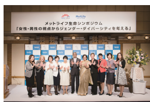
“Metlife Life Symposium: Thinking about Gender Diversity from Women and Men's Perspectives” on August 27, 2015 (Organizer: Metlife)