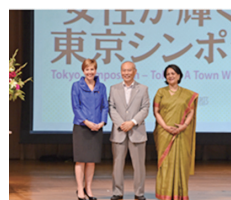
“A city where women shine – Tokyo Symposium” on August 31, 2015 (Organizer: Tokyo Metropolitan Government)