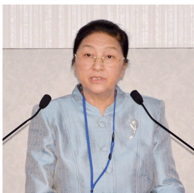
Pany Yathotou, President, National Assembly of the Lao PDR