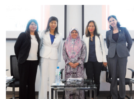
“WAW! Brunei Darussalam 2015” on October 21, 2015 (Organizer: Embassy of Japan in Brunei)