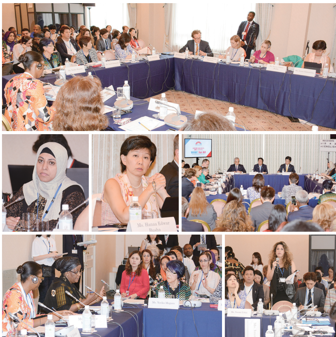
View of the Venue

The discussion also covered economic recovery after conflict, and measures to utilize local women's organization and civil society were proposed. It was also mentioned that, at this point, the private sector can contribute to the revitalization of the local economy and development of entrepreneurship.