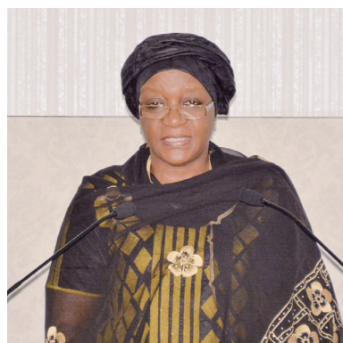
Zainab Hawa Bangura, Special Representative of the Secretary-General on Sexual Violence in Conflict