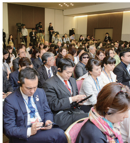
View of the Venue