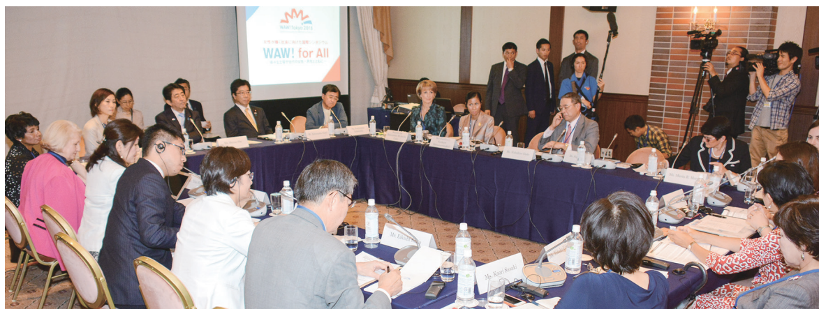
View of the Venue

Many participants from overseas indicated the need to deal with what is known as the new “millennium generation.” They have different values regarding work and family, so it is necessary to design new working environments utilizing ICT in order to manage them. Managers and leaders must change their mind set. There was a suggestion to change primary school curriculum in order to change mind sets at an earlier stage.