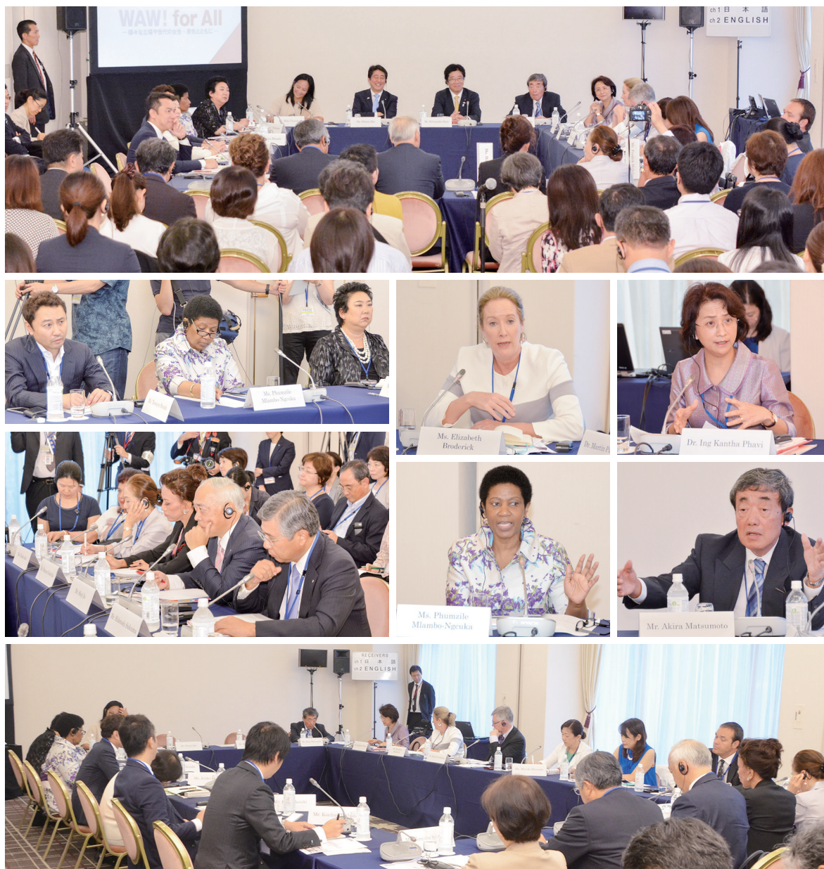
View of the Venue

Proposals were also made to engage more men in these movements and to change behavior by increasing recognition of the economic impact of women's empowerment and expanding the mentality that it is “cool” for both men and women to participate in child rearing. Participants shared ideas such as PR activities to express men's interests and satisfaction.