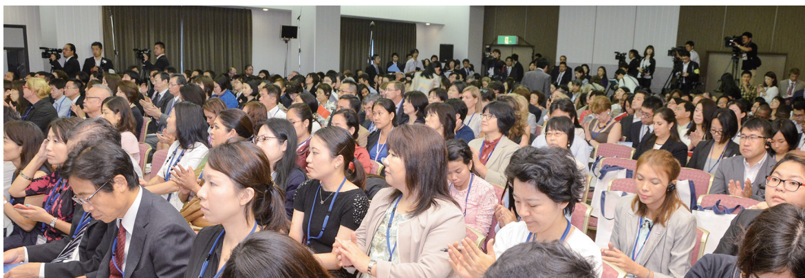
View of the Venue