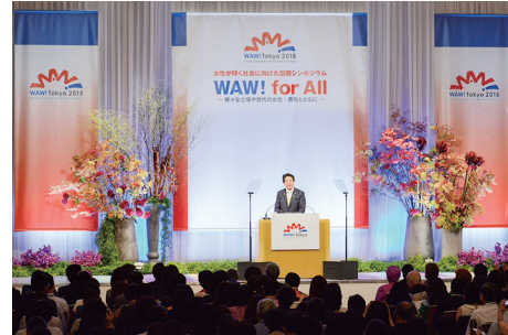
Shinzo Abe, Prime Minister of Japan

The Public Forum was held on August 28th. The stage at the Grand Prince Hotel New Takanawa "Hiten" was decorated with brilliant flowers, and about 1,500 attendees gathered in the audience. Since taking office, Prime Minister Abe set the realization of "a society where women shine" as one of the most important issues and has made this well known. In his opening remarks, rather than emphasizing "why we should actively promote women's participation," he emphasized that we have come to the stage to concretely discuss "how we can implement women's empowerment." He mentioned that Japan's Diet has enacted a new bill aimed at enhancing the role of women in society and how the Government of Japan will continue to cooperate with UN Women and other organizations to realize a society free from human rights violations. He also discussed how Japan will donate more than 42 billion yen over the next 3 years for the field of girls' education and will emphasize women's