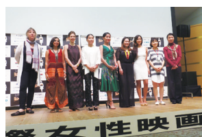
“Aichi International Women's Film Festival 2015” on August 31, 2015 (Organizer: Aichi Gender Equality Foundation)