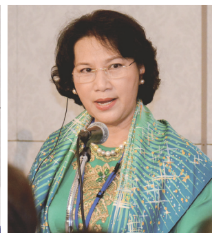
Nguyen Thi Kim Ngan, Vice President of the National Assembly of Viet Nam