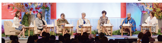
Panel Discussion: Girls' Education

In the remarks from Phumzile Mlambo-Ngcuka, Executive Director of UN Women, an organization which has a strong partnership with Japan,