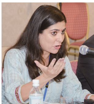
View of the Rapporteur' Presentation-1