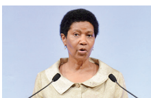
Phumzile Mlambo-Ngcuka, Executive Director, UN Women

she announced that the opening ceremony for the UN Women Japan Liaison Office would be held on August 30th and introduced a video message from Nicole Kidman, a UN Women Goodwill Ambassador. Greetings from others included a speech from Sadayuki Sakakibara, Chairman of Keidanren, and video messages from Christine Lagarde, IMF Managing Director, and Michelle Obama, First Lady of the United States. Audience members were captivated by the words of people representing such different areas.