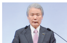
Sadayuki Sakakibara, Chairman of Keidanren