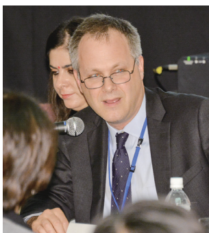
View of the Rapporteur' Presentation-2