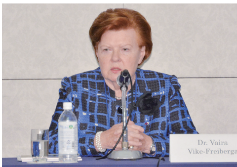
Vaira Vike-Freiberga, President of Club de Madrid; President of Latvia (1999-2007)