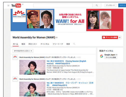
Official YouTube WAW! Channel