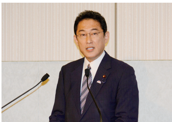
Fumio Kishida, Minister of Foreign Affairs

On August 29th, participants gathered together for the High-Level Roundtables and Special Sessions, and speeches were given to appropriately kick-off a full day of discussions.