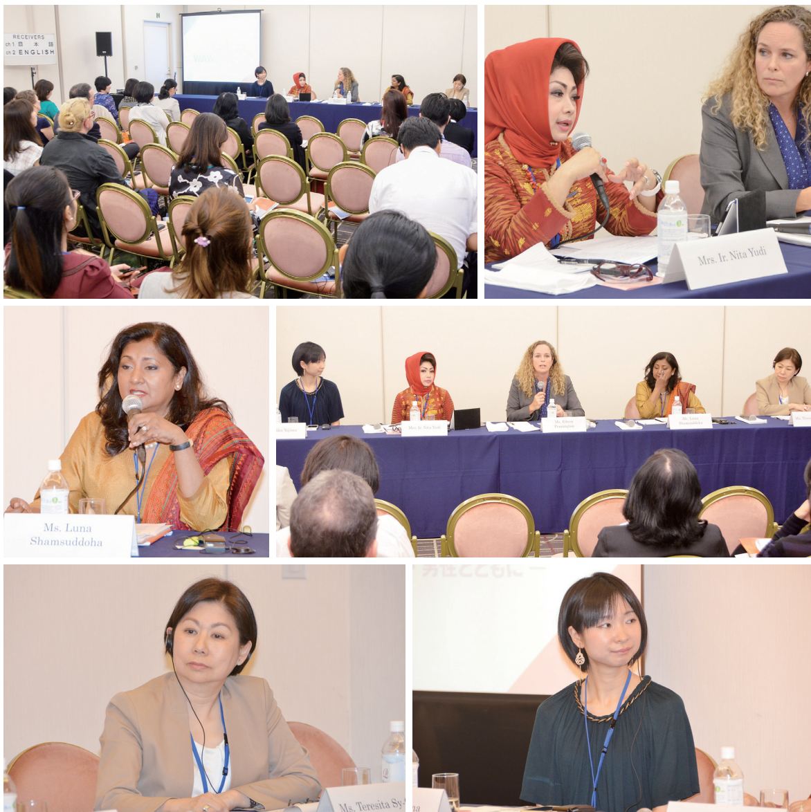
View of the Venue

Students who are future entrepreneurial candidates gathered in the audience as well, and the panelists gave them advice on the importance of having the spirit to try again even after failing once. In addition, they made proposals to society on the importance of creating an environment where women can step forward without being overly cautious of work-life balance or risk-taking, and foster a culture that values people who try again after failing once.