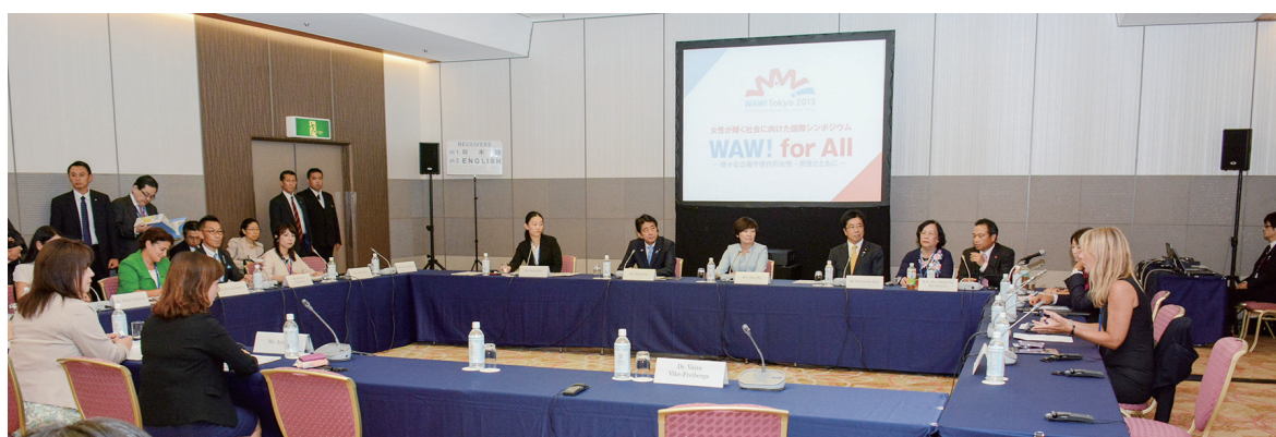
View of the Venue

Participants also shared many situations, issues, and solutions for single mothers in poverty. Participants discussed successes in taking actions into practice. There are ways to support single mothers at every step so that they can step out of poverty and keep participating in the labor market utilizing their abilities while simultaneously balancing child rearing.