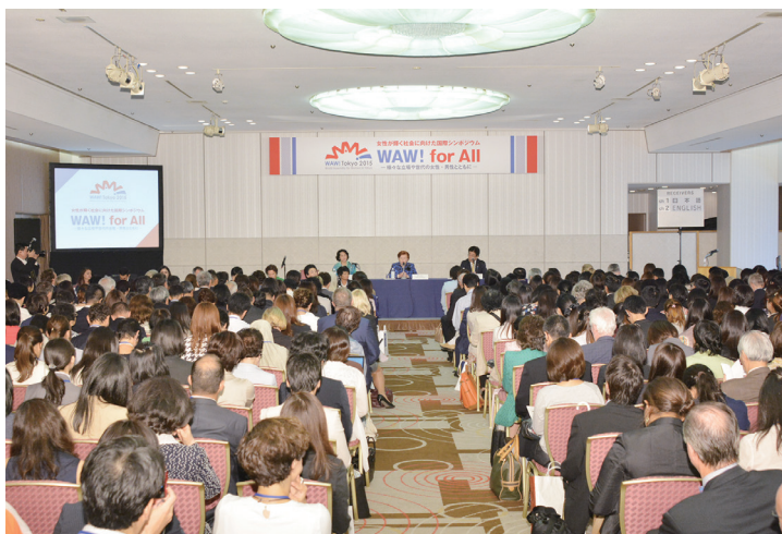
View of the Venue