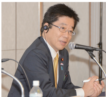
Katsunobu Kato, Deputy Chief Cabinet Secretary, Head of Cabinet Bureau of Personnel Affairs (then)

The Closing Session was held, and rapporteurs from all High-Level Roundtables and representative from the Youth Table presented summaries of the discussions. Katsunobu Kato, Deputy Chief Cabinet Secretary (then), mentioned in his remarks that secretariat team would release the Summary Report “WAW! To Do 2015” based on the presentation given this day. (UN Document A/C.3/70/3.)