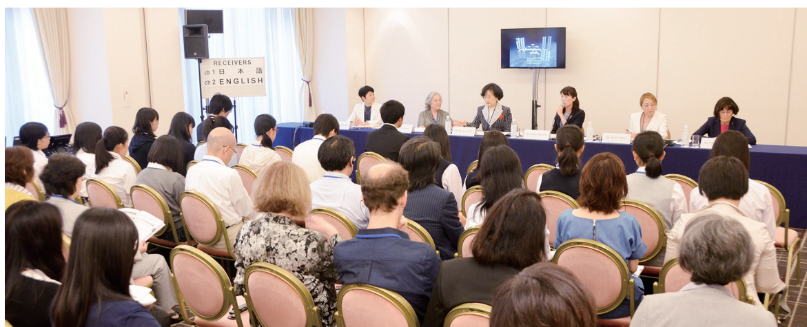
View of the Venue

The field of science may tend to be recognized as a male's field, and female students hesitate to choose it. In order to prevent this situation, panelists shared various ideas, such as establishing support systems (mentor systems, etc.), indicating a career after graduating school, and reinforcing active women's networks in the field for female students majoring in science in higher education and below.