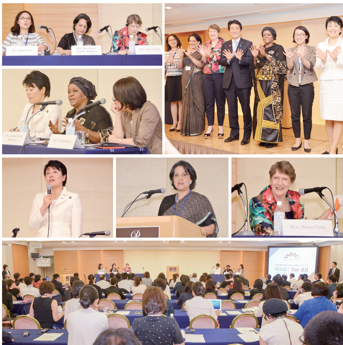
View of the Venue

In the world, an estimated 2.5 billion people do not have easy access to hygienic sanitation facilities, and approximately 1 billion people are still practicing open defecation on a daily basis. This situation causes sanitary issues, like spreading infection, and critical problems for women, such as sexual violence and interfering with girls' education because of lack of sanitation facilities for them. Each panelist shared her efforts and ideas to address these issues, for example, there has been success in increasing girls' attendance at primary schools by installing sanitation facilities for girls. Cross-border information sharing and discussions were held about the importance of role that restrooms and sanitation facilities play in leading to women's security, empowerment and improvement of quality of life.