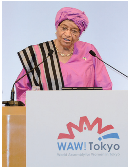
Ellen Johnson Sirleaf, President of the Republic of Liberia

empowerment and gender equality at the G7 Summit, which Japan will host next year. The first keynote speaker was H.E. Ms. Ellen Johnson Sirleaf, President of the Republic of Liberia. She mentioned that women can manage themselves, and further, manage countries, by building confidence and fostering self-esteem, and she shared her experience of overcoming stereotypes and many difficulties to become the first democratically-elected woman president in Africa. She issued a message that "when women shine the world smiles."