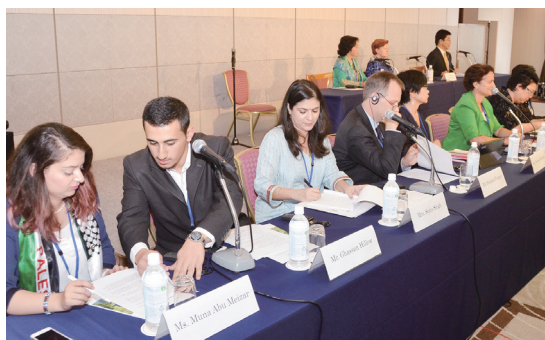
View of the Rapporteur' Presentation-3