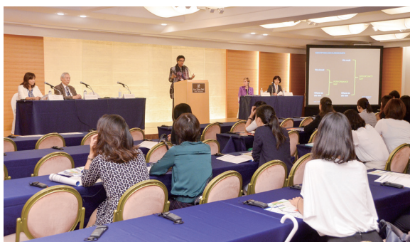
View of the Venue

In Japan, the central government and local governments are promoting the idea that companies which make efforts to promote workplace diversity and keep all their human resources active are able to realize innovation. However, panelists presented and shared many issues that still exist. For instance, it is important not just to promote women to managerial positions, but also to provide them with a working environment where they can experience innovation. Also, in order to narrow the gender gap in wages, it is necessary to solve problems related to the gender gap in promotion rates, turnover of women from permanent jobs during child rearing, and the perception of gender roles.