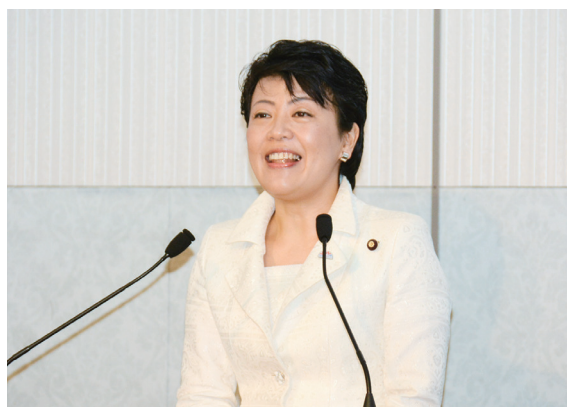
Haruko Arimura, Minister in charge of Women's Empowerment and Minister of State for Gender Equality (then)