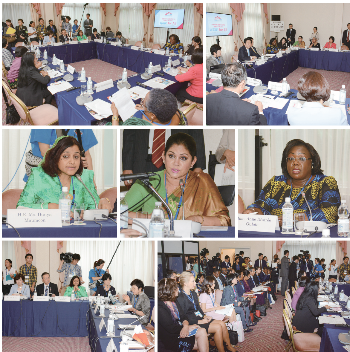
View of the Venue

It has been a development goal to ensure all children receive primary education. However, on the way to realizing this goal, participants shared the difficult situations girls experience to complete primary and secondary education, particularly problems facing adolescent girls. Discussions were held on how to protect girls from social customs (child marriage, early pregnancy, child labor, prejudice, and violence) which prevent girls’ education, to create safe environments for girls to attend schools, to develop and assign jobs to female teachers with high specialties, and to make it possible for girls to graduate primary and secondary education and receive higher education the same as boys. There were also proposals based on regional situations; for example, women’s colleges are especially effective in developing countries to enable girls to graduate higher education, and it is necessary to expand scholarships.