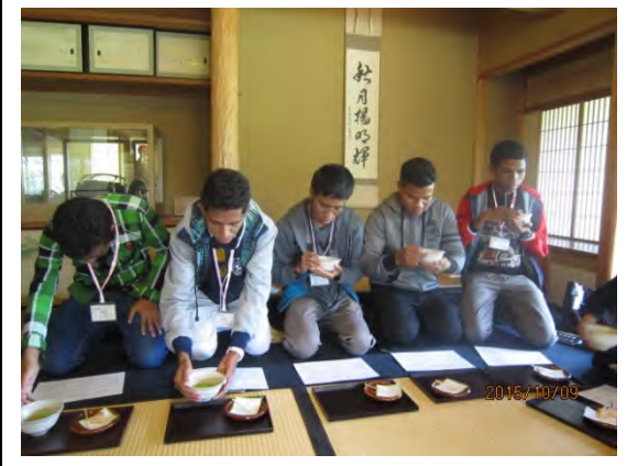
10/9 【Cultural Experience】 Tea Ceremony (Himeji City)