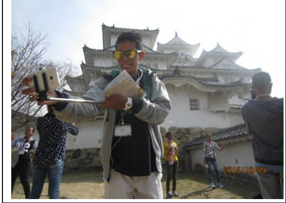
10/9 【Historical Landmark】 Himeji Castle (Himeji City)

10/8 [Observation of Hospital] Osaka General Medical Center (Osaka City)