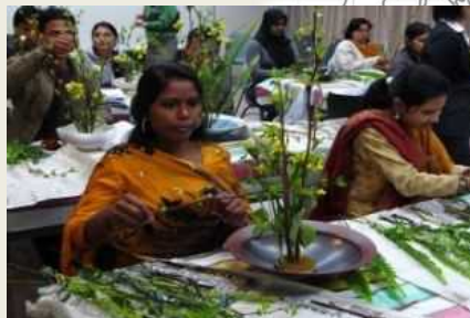
Cultural Exchange: Flower Arrangement