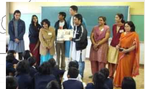
School Exchange: Visit to a Japanese Language School