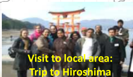
Visit to local area: Trip to Hiroshima