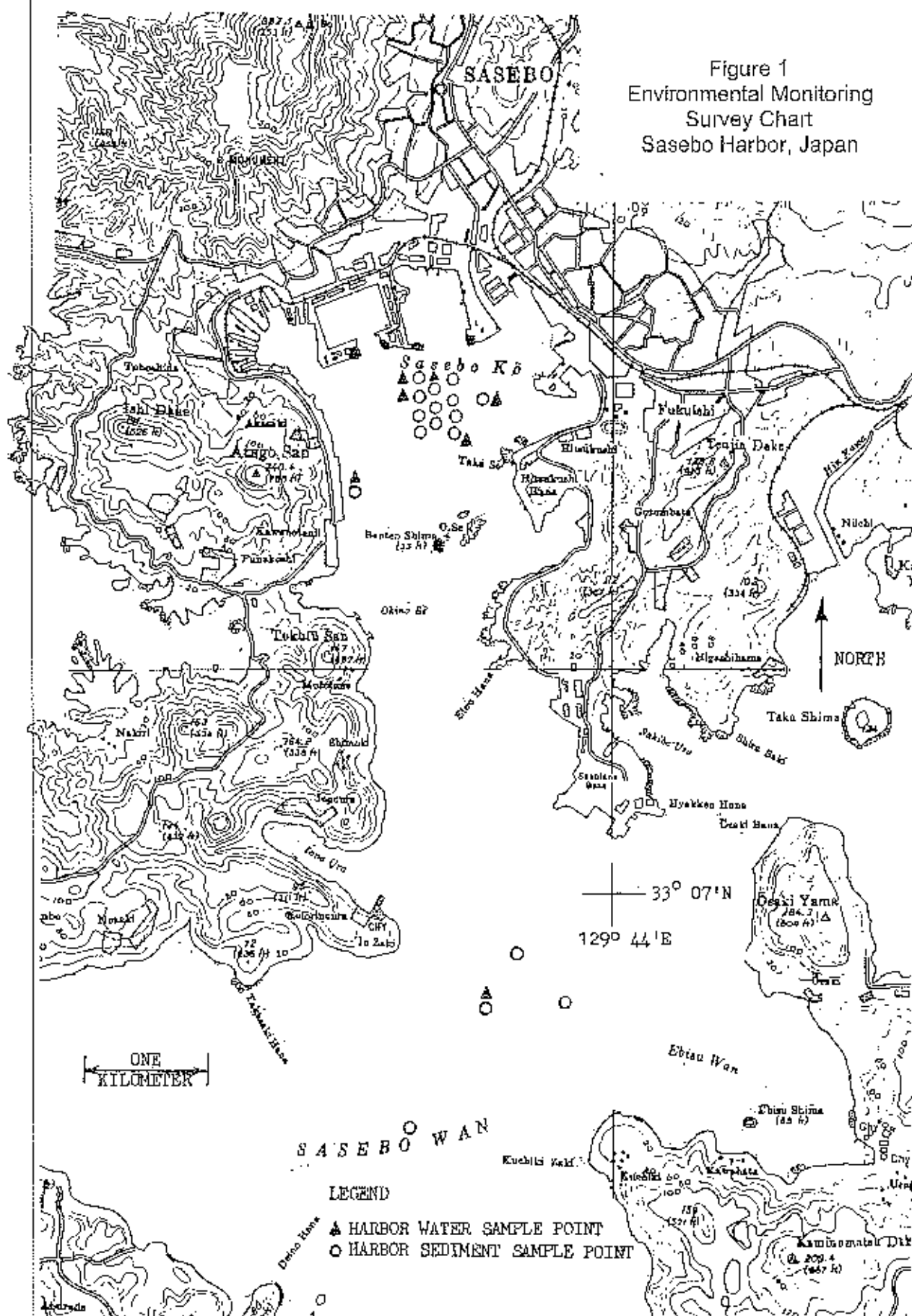
Figure 1 Environmental Monitoring Survey Chart Sasebo Harbor, Japan