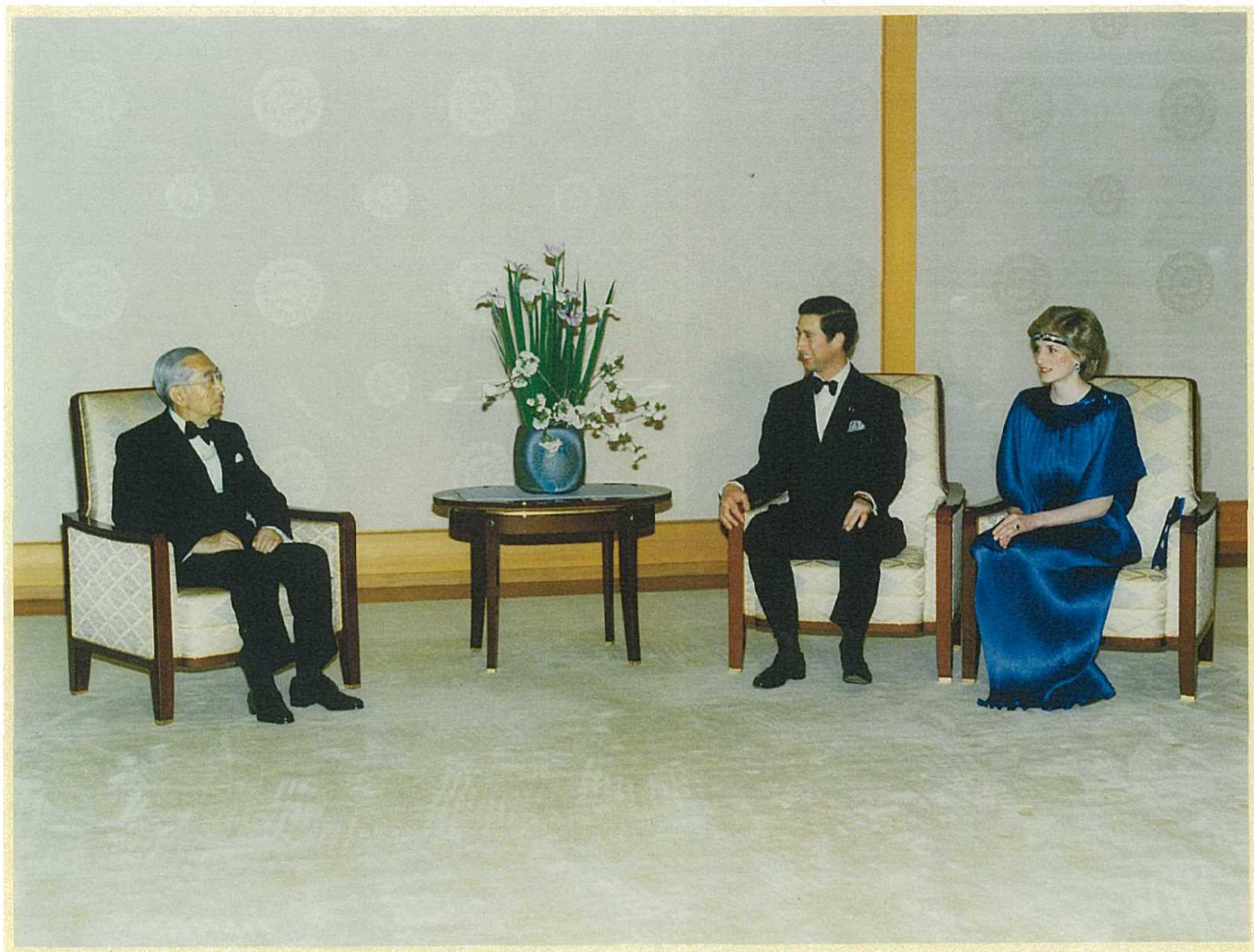
Imperial Audience at Imperial Palace