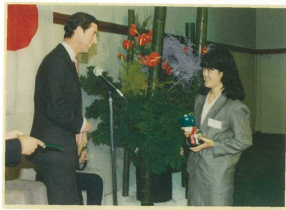
Attend Formal Opening of a New British Council Premises (May 13)