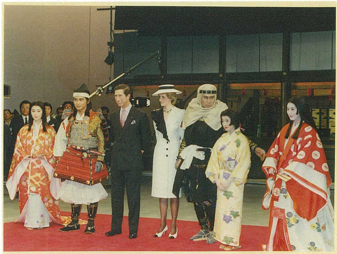
Visit NHK Centre