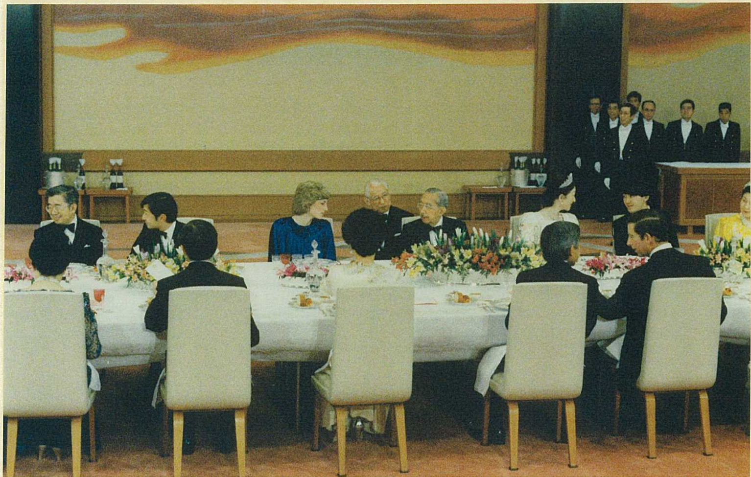
Court Banquet at Imperial Palace