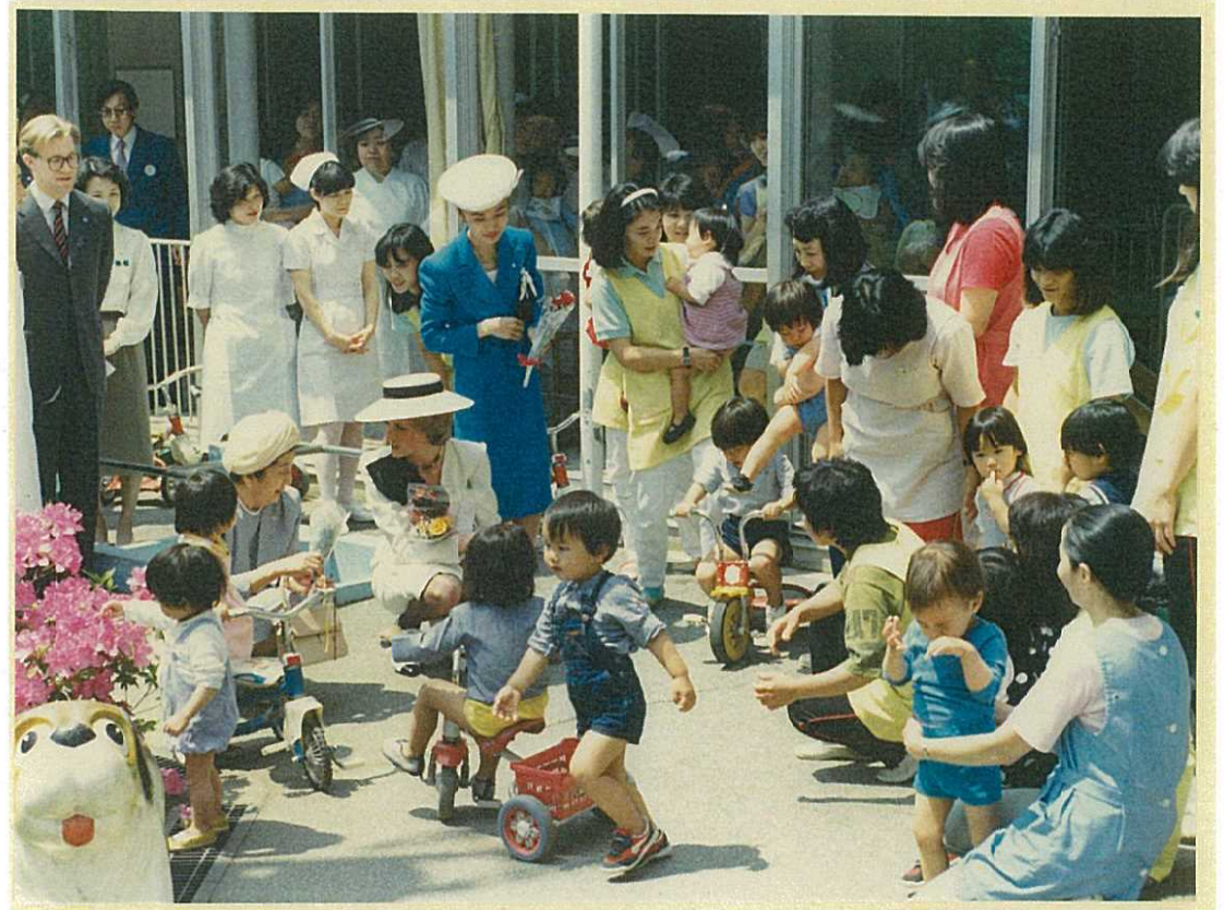
Visit Red Cross Hospital of Japan