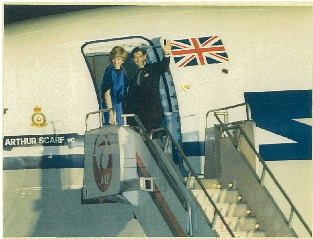
Leave Tokyo International Airport