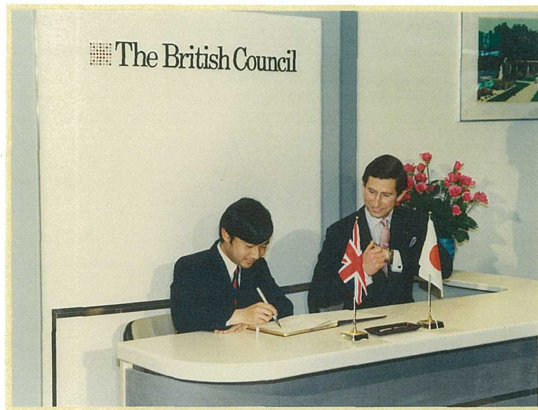
Attend Formal Opening of a New British Council Premises (May 13)