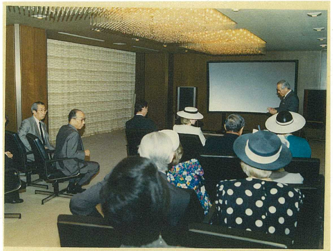
Visit NHK Centre