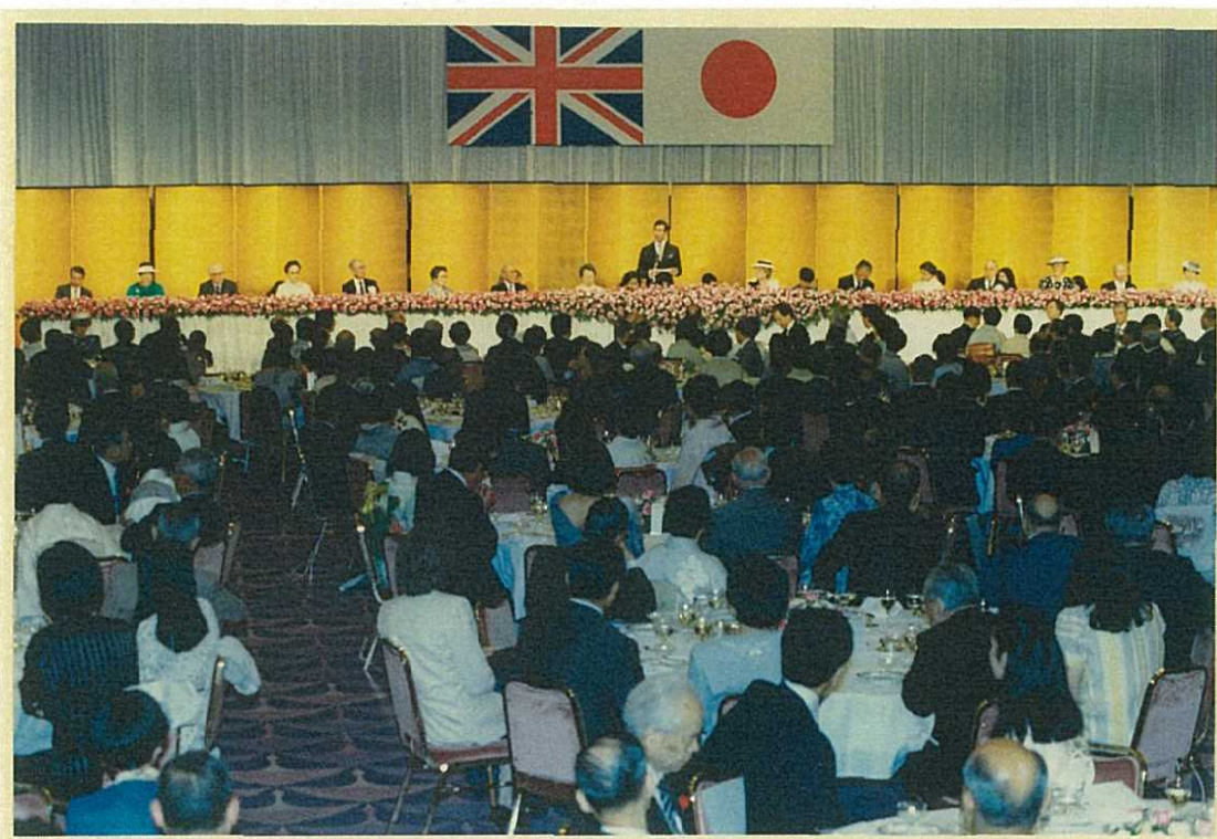
Luncheon Hosted by the Economic Organizations (May 13)