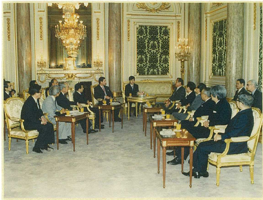
Meeting with UK-Japan 2,000 Group