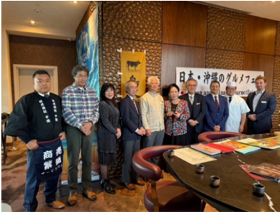
Representatives of Okinawan food and beverage companies and sushi chefs participating in the Japan-Okinawa Gourmet Fair