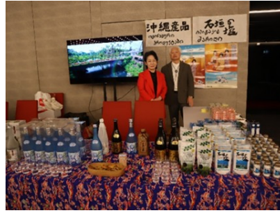
Okinawa Prefecture PR booth at the Emperor's Birthday Reception