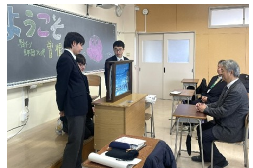
Kamishibai picture-story show presented by the students of Minamisanriku High School