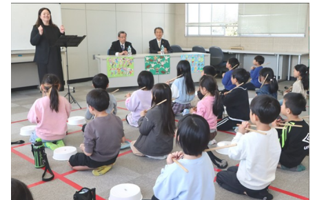
Performance of "Uchibayashi" (traditional festival music) by second-grade students of Shibukawa Elementary School, Owariasahi City