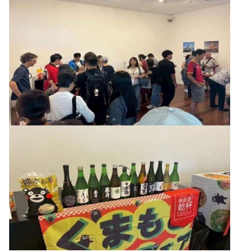
Participants enjoying the display of Kumamoto Prefecture's alcoholic beverages and other local products

The third Kumamoto Prefecture PR event was held in Singapore. This time, under the theme of "Kumamoto Prefecture – The Land of Water ~The cultural and historical hub of sake and shochu~", the event focused on showcasing Kumamoto's beautiful "water", drawing significant interest from attendees. This article introduces this event, which was also officially recognized as part of the Commemorative Events of the 2026 60th Anniversary of the Establishment of Diplomatic Relations between Japan and Singapore(SJ60).