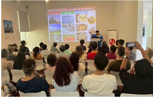
Promotion of the charms of Kumamoto Prefecture by the Director of Kumamoto Prefecture's Asia Office