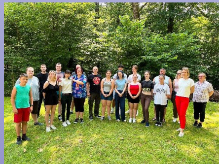
A glimpse of our holiday activities with students from the Japanese language class