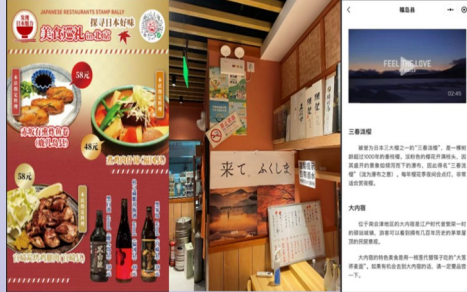
Left: Promoting Kagoshima Prefecture's Satsuma-age (fried fish cakes) and Shochu (Japanese distilled spirit)