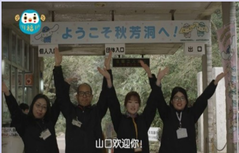
Live streaming to promote the attractions of Yamaguchi Prefecture