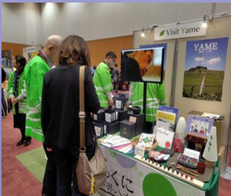
Exhibition at the World Federation of Tourist Guide Associations General Assembly and Post-Tour