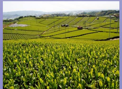
The tea fields of Yame Chuo Grand Tea Plantation

I n 2024, Yame City organized a tour for the diplomatic corps in Japan, co-hosted by the Ministry of Foreign Affairs. Under the theme "Bringing Yame to the World," the city is strengthening the export and promotion of its specialty products, including Yame tea. Additionally, it is undertaking initiatives such as conducting ESG assessments of Yame tea to enhance its value. Please watch our interview to learn more about these efforts.