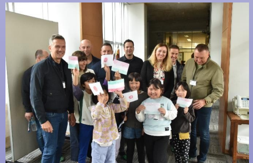
Welcoming the delegation from Sopron City and the children during their visit to the elementary school

K azuno City in Akita Prefecture and Sopron in Hungary have maintained a sister-city relationship for over 20 years. Last year, an official delegation led by the mayor of Sopron visited Kazuno City and interacted with residents. Furthermore, since 1997, Kazuno City and the Kazuno International Exchange Association have been dispatching “Japanese language instructors,” and it is through these citizen-led exchanges that the sister city relationship between the two cities is sustained.