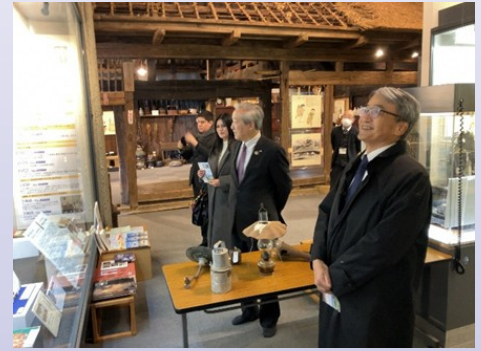
Visit to Adatarara Furusato Hall