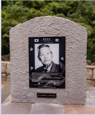
Commemorative plaque honoring Yokichi Nouchi