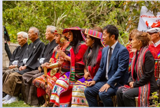
Scene of the ceremony