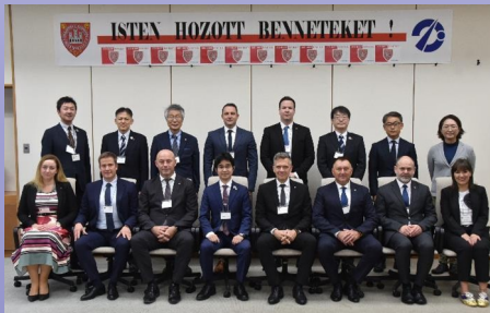
Hosting a delegation for the first time in nine years