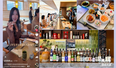
Post about the event shared via the social media accounts of the key opinion leader of Guangdong Province (approx. 1 million followers), the Consulate-General in Guangzhou (approx. 130,000 followers), and the Embassy in China (approx. 1.4 million followers)

F rom October 2025 to March 2026, the Ministry of Foreign Affairs of Japan, the Embassy of Japan in China, and the Consulate-General of Japan in Guangzhou implemented a promotional project in Beijing and Shenzhen to showcase the tourism, culture, and cuisine of various regions across Japan in close collaboration with Japanese local governments, relevant companies and organizations. The project was designed to help consumers in Beijing and Shenzhen experience the appeal of Japanese regions and to promote sales and increase exports of Japanese food and products.