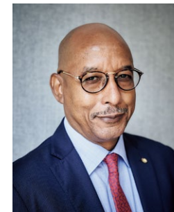
Ibrahim Assane Mayaki, African Union Special Envoy for Food Systems, Former Prime Minister of Niger, Former Chief Executive Officer of the African Union Development Agency-New Partnership for Africa's Development (AUDA-NEPAD)

Japan's cooperation with Africa through the Tokyo International Conference on African Development (TICAD) highlights a long-term partnership centered on sustainable growth, resilience, and mutual respect. Through its ODA, Japan has bolstered Africa's infrastructure, healthcare, education, and governance, empowering African nations toward self-reliance. Looking ahead, Japan's commitment to technology transfer, climate adaptation, and human resources development presents transformative opportunities in green energy, digital innovation, and food security. As Africa continues its growth, Japan's focus on deepening trade relations and fostering private sector engagement promises an evolving partnership that addresses shared challenges and drives sustainable impact for both regions. This is a story of mutual trust and ownership.