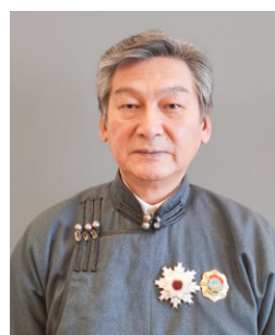
Rentsendoo Jigjid, President of the Mongolia-Japan "Partnership Association," former Minister of Mining of Mongolia and former Ambassador Extraordinary and Plenipotentiary of Mongolia to Japan

Japanese NGOs have grown rapidly since the 1990s, implementing projects funded by ODA. Currently, approximately 700 organizations with legal status are actively operating across the globe. Recognizing this trend, the revised Development Cooperation Charter in 2023 designates NGOs as "strategic partners in Japan's development cooperation." NGOs possess key strengths, such as high expertise in humanitarian and development assistance, in-depth understanding of local contexts, efficient use of funds, and the use of new approaches and innovative methods. In order to leverage these strengths and deepen cooperation with the Government of Japan, we anticipate new schemes that encourage NGO participation and increased funding levels comparable to those of other OECD countries.