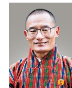
Lyonchhen Tshering Tobgay, Prime Minister of Bhutan

Japan's cooperation with Africa through the Tokyo International Conference on African Development (TICAD) highlights a long-term partnership centered on sustainable growth, resilience, and mutual respect. Through its ODA, Japan has bolstered Africa's infrastructure, healthcare, education, and governance, empowering African nations toward self-reliance. Looking ahead, Japan's commitment to technology transfer, climate adaptation, and human resources development presents transformative opportunities in green energy, digital innovation, and food security. As Africa continues its growth, Japan's focus on deepening trade relations and fostering private sector engagement promises an evolving partnership that addresses shared challenges and drives sustainable impact for both regions. This is a story of mutual trust and ownership.