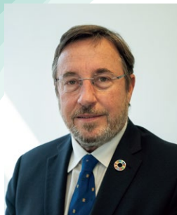
Achim Steiner, Administrator of the United Nations Development Programme (UNDP)

As Japan marks 70 years of development cooperation, the United Nations Development Programme (UNDP) is proud to continue our enduring partnership in driving global progress within a profoundly evolving development landscape. Yet our efforts to co-create life-changing development solutions – anchored in principles such as human security and dignity and putting the Humanitarian-Development-Peace Nexus into action – have remained consistent. At this milestone, I extend my deepest gratitude to the people and Government of Japan for their unwavering support of multilateralism and UNDP. Together, as we advance the Sustainable Development Goals, we are demonstrating that the most valuable investments we make today are the opportunities we leave for the generations to come.